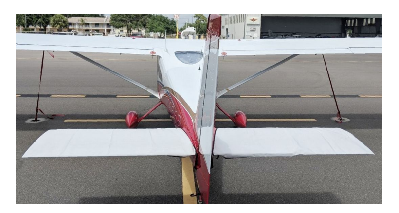
Cessna 162 Skycatcher Horizontal Stabilizer Covers