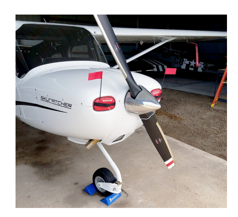
Cessna Skycatcher 162 Engine Inlet Plugs

Engine Inlet Plugs are custom fit for your Cessna Skycatcher 162 intakes, made with heavy-duty vinyl material, and stuffed with a single block of sculpted urethane foam. Each plug has a zipper that allows the foam to be removed and dried if necessary. Engine plugs have warning flags that are visible from the cockpit or 'remove before flight' streamers sewn onto the face of the plugs. Most plugs are imprinted with the aircraft registration number in black for an extra charge. Storage bag NOT included. Engine plugs may be inserted after flight when the engine is still warm. Engine Inlet Plugs are commonly referred to as Cowl Plugs, Intake Plugs, Cowl Blocks, Engine Blocks, and Engine Bungs.