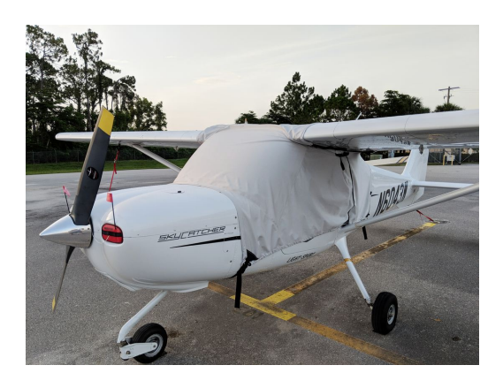
Cessna Skycatcher Standard Canopy Cover, Propellor Cover & Engine Cessna Skycatcher 162 Canopy Cover and Engine Inlet Inlet Plugs Plugs