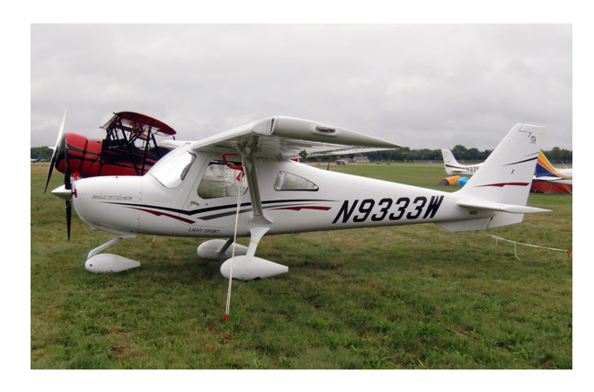
Cessna Skycatcher 162 Heatshield Set