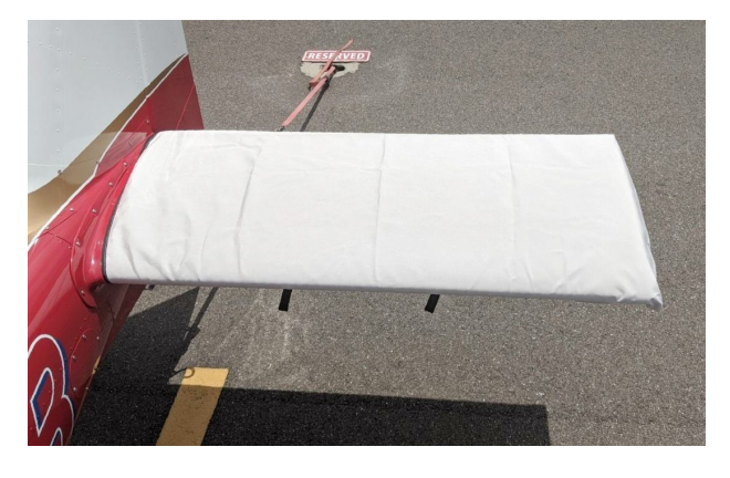
Cessna 162 Skycatcher Horizontal Stabilizer Covers