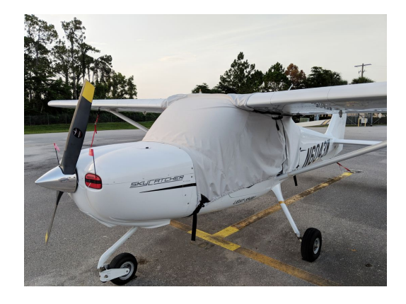
Cessna Skycatcher 162 Canopy Cover and Engine Inlet Plugs