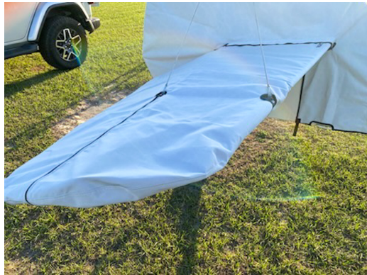
Aeronca Sedan Empennage Cover (Tailboom, Vertical & Horiz Stabilizers), All Year Use

shorter useful life if used continuously outside than the all-year use material.