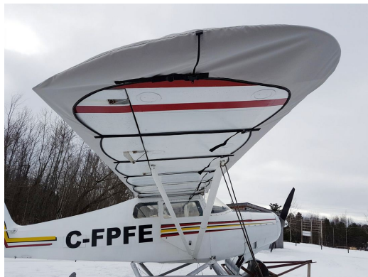
Christavia Mk 1 Wing Covers

shorter useful life if used continuously outside than the all-year use material.