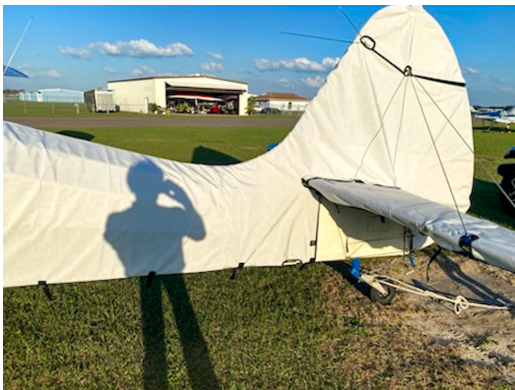
Aeronca Sedan Empennage Cover (Tailboom, Vertical & Horiz Stabilizers), All Year Use