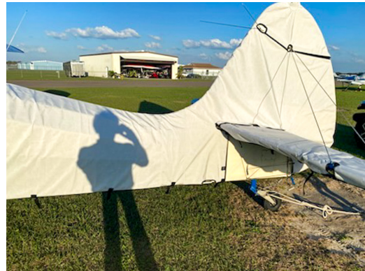
Aeronca Sedan Empennage Cover (Tailboom, Vertical & Horiz Stabilizers), All Year Use