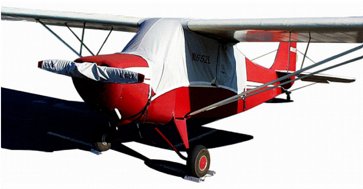
Aeronca Champ Canopy & Prop Covers