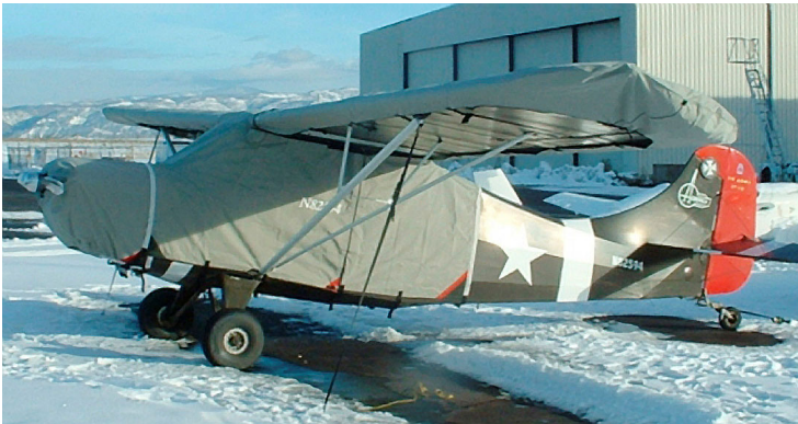
Extended Canopy Cover, Engine & Wing Covers

This cover type is made from Silver Acrylic Sunbrella canvas and is 100% lined with a soft and smooth microfiber. Bruce's Custom Covers developed this material combination especially for aircraft protection. The outer material is medium weight and treated for water resistance, UV resistance and anti-static buildup. The inner lining is a very soft and smooth microfiber to prevent scratching. The material is very reflective, and tests show that the cabin interior temperature can be reduced to near-ambient temperature on the hottest of days. It is water, ice and snow repellent, yet breathable to allow moisture to escape from between the cover and the aircraft surface.