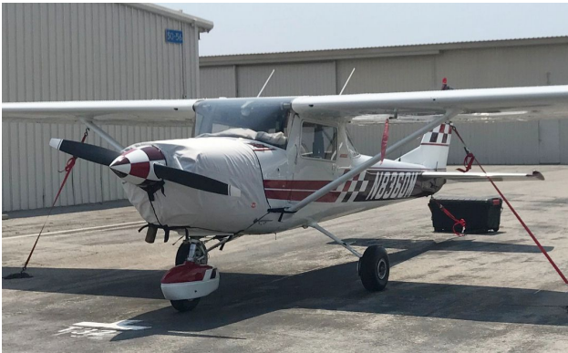
Cessna 150 Engine Cover