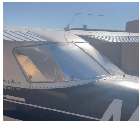
Cessna 150 Cabin HeatShields