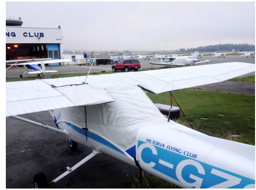
Cessna 150 Over-Top Canopy Cover