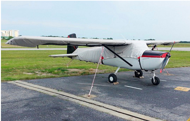
Cessna 150 Over-Top Canopy Cover, Wing Covers & Partial Empennage Cover

This cover type is made from Silver Acrylic Sunbrella canvas and is 100% lined with a soft and smooth microfiber. Bruce's Custom Covers developed this material combination especially for aircraft protection. The outer material is medium weight and treated for water resistance, UV resistance and anti-static buildup. The inner lining is a very soft and smooth microfiber to prevent scratching. The material is very reflective, and tests show that the cabin interior temperature can be reduced to near-ambient temperature on the hottest of days. It is water, ice and snow repellent, yet breathable to allow moisture to escape from between the cover and the aircraft surface.