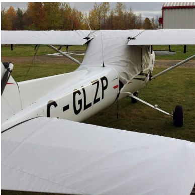
Cessna 150 & 152 Horizontal Stabilizer Covers, Winter Use

WINTER USE MATERIAL - Made with Solution-Dyed Polyester fabric, this option is intended for seasonal use to aid in deicing, rain mitigation, or for occasional travel. The material is lighter and more compact, but more susceptible to UV damage and may have a shorter useful life if used continuously outside than the all-year use material.