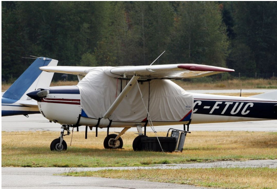
Cessna 150M Extended Canopy Cover