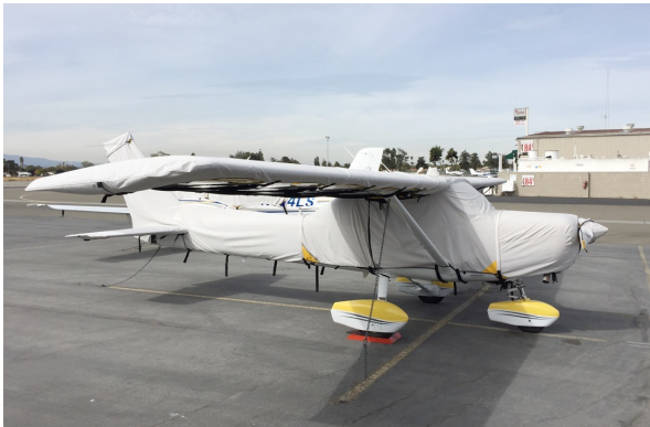
Cessna 150 Extended Canopy, Wing, Prop, and Empennage Cover

This cover type is made from Silver Acrylic Sunbrella canvas and is 100% lined with a soft and smooth microfiber. Bruce's Custom Covers developed this material combination especially for aircraft protection. The outer material is medium weight and treated for water resistance, UV resistance and anti-static buildup. The inner lining is a very soft and smooth microfiber to prevent scratching. The material is very reflective, and tests show that the cabin interior temperature can be reduced to near-ambient temperature on the hottest of days. It is water, ice and snow repellent, yet breathable to allow moisture to escape from between the cover and the aircraft surface.