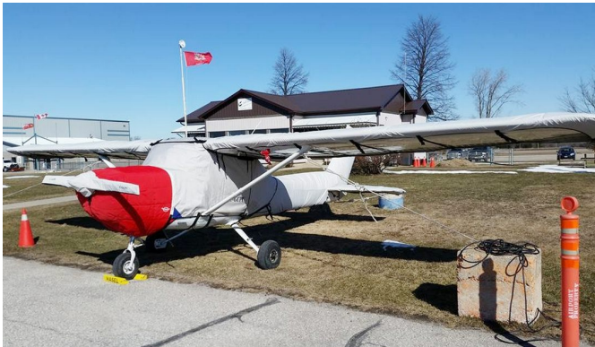
Cessna 150 Full Cover Set

This cover type is made from Silver Acrylic Sunbrella canvas and is 100% lined with a soft and smooth microfiber. Bruce's Custom Covers developed this material combination especially for aircraft protection. The outer material is medium weight and treated for water resistance, UV resistance and anti-static buildup. The inner lining is a very soft and smooth microfiber to prevent scratching. The material is very reflective, and tests show that the cabin interior temperature can be reduced to near-ambient temperature on the hottest of days. It is water, ice and snow repellent, yet breathable to allow moisture to escape from between the cover and the aircraft surface.