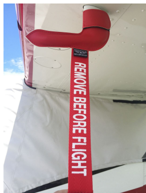
Cessna A185F Pitot Cover

Engine Inlet Plugs are custom fit for your Cessna 150 & 152 intakes, made with heavy-duty vinyl material, and stuffed with a single block of sculpted urethane foam. Each plug has a zipper that allows the foam to be removed and dried if necessary. Engine plugs have warning flags that are visible from the cockpit or 'remove before flight' streamers sewn onto the face of the plugs. Most plugs are imprinted with the aircraft registration number in black for an extra charge. Storage bag NOT included. Engine plugs may be inserted after flight when the engine is still warm. Engine Inlet Plugs are commonly referred to as Cowl Plugs, Intake Plugs, Cowl Blocks, Engine Blocks, and Engine Bungs.