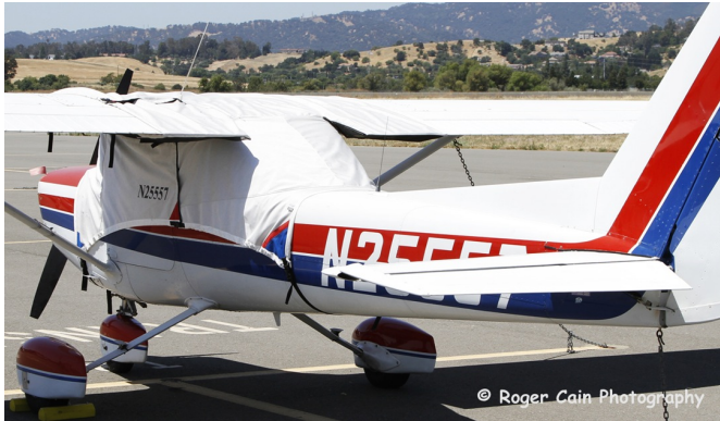
Cessna 150 Over-the-Top Canopy Cover

This cover type is made from Silver Acrylic Sunbrella canvas and is 100% lined with a soft and smooth microfiber. Bruce's Custom Covers developed this material combination especially for aircraft protection. The outer material is medium weight and treated for water resistance, UV resistance and anti-static buildup. The inner lining is a very soft and smooth microfiber to prevent scratching. The material is very reflective, and tests show that the cabin interior temperature can be reduced to near-ambient temperature on the hottest of days. It is water, ice and snow repellent, yet breathable to allow moisture to escape from between the cover and the aircraft surface.