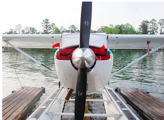
Cessna 150 Engine Plugs