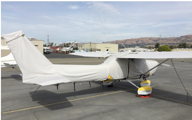
Cessna 150 Extended Canopy, Wing, Prop, and Empennage Cover

WINTER USE MATERIAL - Made with Solution-Dyed Polyester fabric, this option is intended for seasonal use to aid in deicing, rain mitigation, or for occasional travel. The material is lighter and more compact, but more susceptible to UV damage and may have a shorter useful life if used continuously outside than the all-year use material.