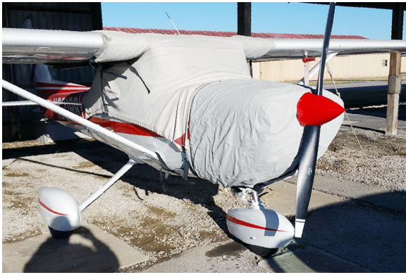
Cessna 150 Canopy and Engine Cover