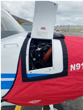
Cessna 150 Insulated Engine Cover