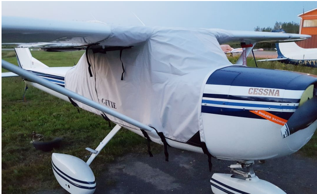
Cessna 150 Extended Canopy Cover