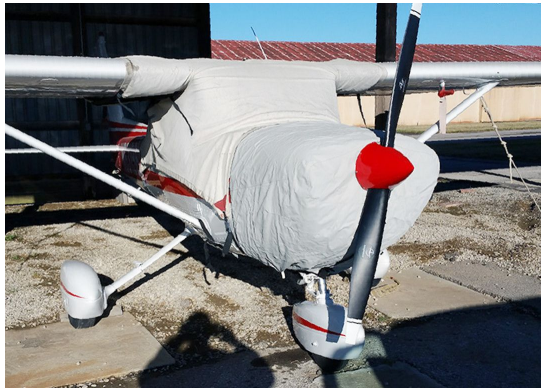
Cessna 150 Canopy and Engine Cover