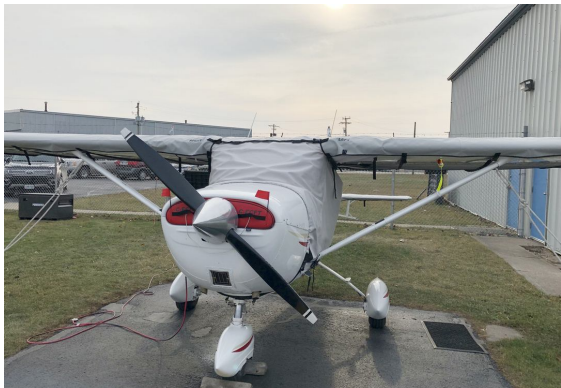
Cessna 150J Wing Cover Winter Use