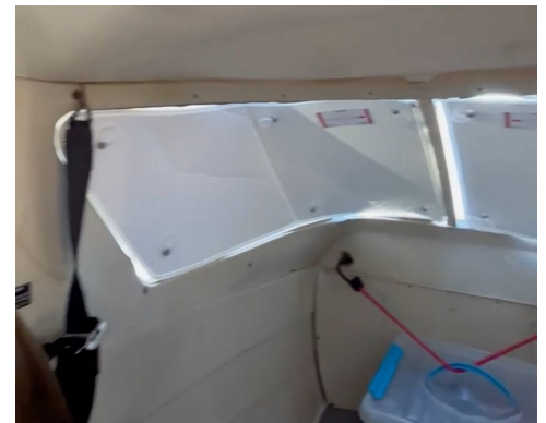
Cessna 150 Cabin HeatShields