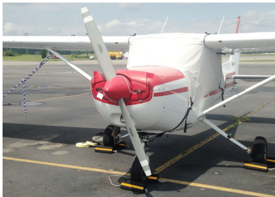
Cessna 150 Engine Plugs

Engine Inlet Plugs are custom fit for your Cessna 150 & 152 intakes, made with heavy-duty vinyl material, and stuffed with a single block of sculpted urethane foam. Each plug has a zipper that allows the foam to be removed and dried if necessary. Engine plugs have warning flags that are visible from the cockpit or 'remove before flight' streamers sewn onto the face of the plugs. Most plugs are imprinted with the aircraft registration number in black for an extra charge. Storage bag NOT included. Engine plugs may be inserted after flight when the engine is still warm. Engine Inlet Plugs are commonly referred to as Cowl Plugs, Intake Plugs, Cowl Blocks, Engine Blocks, and Engine Bungs.