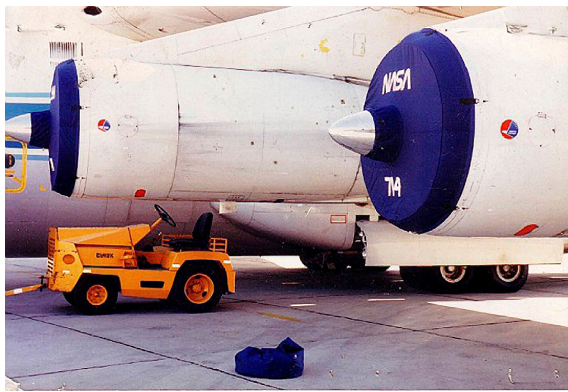
Intake Covers for Lockheed C-141