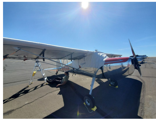
Cessna 140 Over The Top Style Canopy Cover