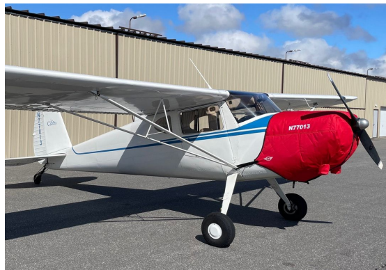
Cessna 140 Insulated Engine Cover