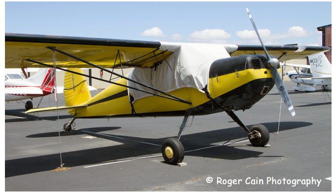
Cessna 140 Over-The-Top Style Canopy Cover