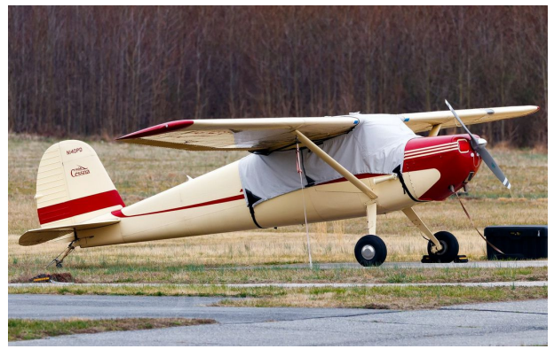
Cessna 140 Canopy Cover