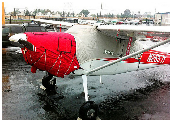
Cessna 180 Insulated Engine Cover