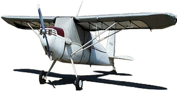
Cessna 120 Canopy Cover & Wing Covers

This cover type is made from Silver Acrylic Sunbrella canvas and is 100% lined with a soft and smooth microfiber. Bruce's Custom Covers developed this material combination especially for aircraft protection. The outer material is medium weight and treated for water resistance, UV resistance and anti-static buildup. The inner lining is a very soft and smooth microfiber to prevent scratching. The material is very reflective, and tests show that the cabin interior temperature can be reduced to near-ambient temperature on the hottest of days. It is water, ice and snow repellent, yet breathable to allow moisture to escape from between the cover and the aircraft surface.