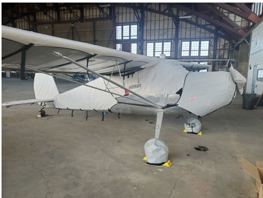
Cessna 140 Canopy, Wings, Prop, Tires & Empennage Covers

This cover type is made from Silver Acrylic Sunbrella canvas and is 100% lined with a soft and smooth microfiber. Bruce's Custom Covers developed this material combination especially for aircraft protection. The outer material is medium weight and treated for water resistance, UV resistance and anti-static buildup. The inner lining is a very soft and smooth microfiber to prevent scratching. The material is very reflective, and tests show that the cabin interior temperature can be reduced to near-ambient temperature on the hottest of days. It is water, ice and snow repellent, yet breathable to allow moisture to escape from between the cover and the aircraft surface.