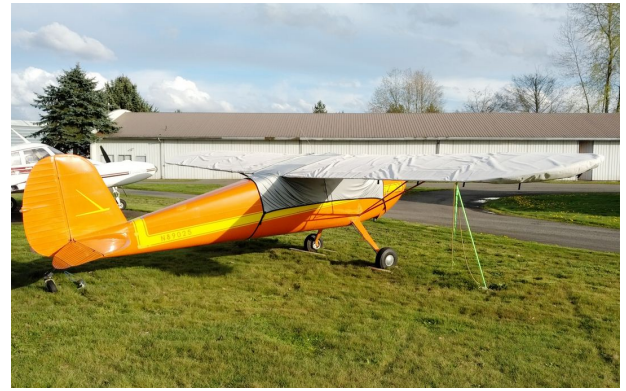
Cessna 120 & 140 Wing Covers