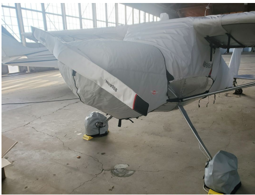
Cessna 140 Canopy, Wings, Prop, Tires & Empennage Covers