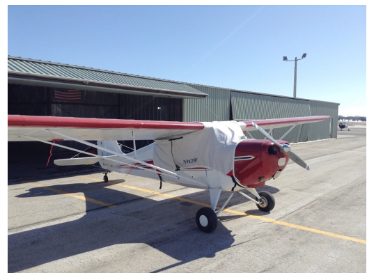
Aeronca Chief Canopy Cover