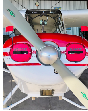
Aeronca 7AC Engine Inlet Plugs