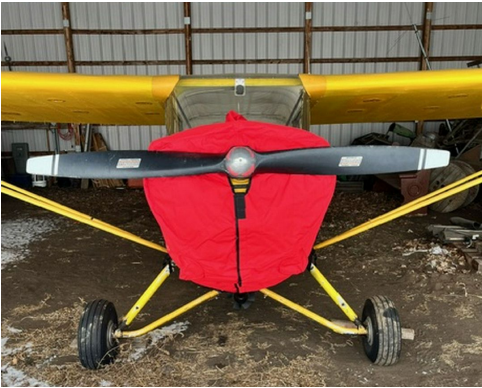
Aeronca 11AC Chief Insulated Engine Cover