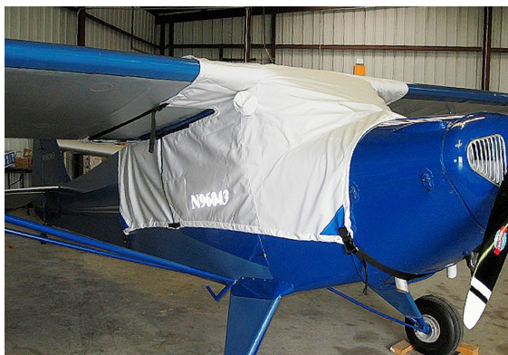
Taylorcraft BC12-D Over-the-top Canopy Cover

This cover type is made from Silver Acrylic Sunbrella canvas and is 100% lined with a soft and smooth microfiber. Bruce's Custom Covers developed this material combination especially for aircraft protection. The outer material is medium weight and treated for water resistance, UV resistance and anti-static buildup. The inner lining is a very soft and smooth microfiber to prevent scratching. The material is very reflective, and tests show that the cabin interior temperature can be reduced to near-ambient temperature on the hottest of days. It is water, ice and snow repellent, yet breathable to allow moisture to escape from between the cover and the aircraft surface.