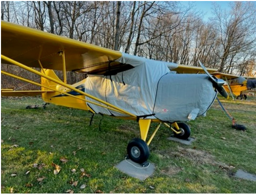
Aeronca Super Chief 11CC Extended Over-Top Canopy Cover, Insulated Engine Cover

This cover type is made from Silver Acrylic Sunbrella canvas and is 100% lined with a soft and smooth microfiber. Bruce's Custom Covers developed this material combination especially for aircraft protection. The outer material is medium weight and treated for water resistance, UV resistance and anti-static buildup. The inner lining is a very soft and smooth microfiber to prevent scratching. The material is very reflective, and tests show that the cabin interior temperature can be reduced to near-ambient temperature on the hottest of days. It is water, ice and snow repellent, yet breathable to allow moisture to escape from between the cover and the aircraft surface.