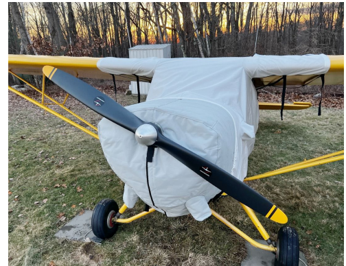
Aeronca Chief 11AC, Super Chief 11CC Insulated Engine Cover