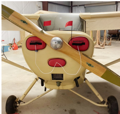
Aeronca 11AC Chief Engine Plugs

Engine Inlet Plugs are custom fit for your Aeronca Chief 11AC, Super Chief 11CC intakes, made with heavy-duty vinyl material, and stuffed with a single block of sculpted urethane foam. Each plug has a zipper that allows the foam to be removed and dried if necessary. Engine plugs have warning flags that are visible from the cockpit or 'remove before flight' streamers sewn onto the face of the plugs. Most plugs are imprinted with the aircraft registration number in black for an extra charge. Storage bag NOT included. Engine plugs may be inserted after flight when the engine is still warm. Engine Inlet Plugs are commonly referred to as Cowl Plugs, Intake Plugs, Cowl Blocks, Engine Blocks, and Engine Bungs.