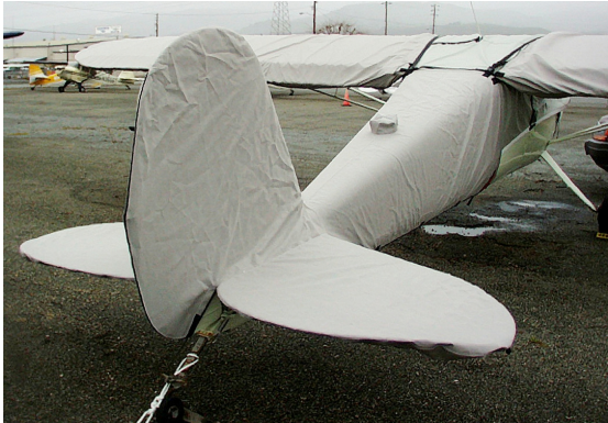
Cessna 120 Empennage Cover