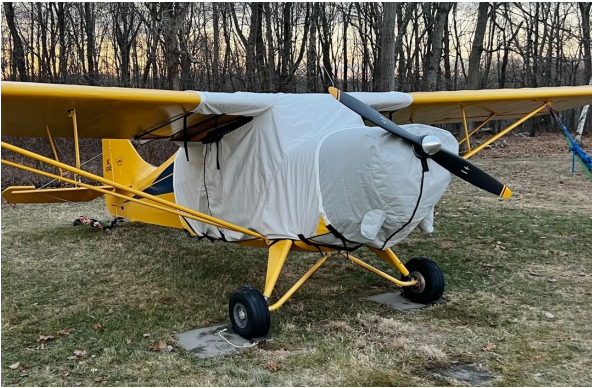
Aeronca Chief 11AC, Super Chief 11CC Insulated Engine Cover

This cover type is made from Silver Acrylic Sunbrella canvas and is 100% lined with a soft and smooth microfiber. Bruce's Custom Covers developed this material combination especially for aircraft protection. The outer material is medium weight and treated for water resistance, UV resistance and anti-static buildup. The inner lining is a very soft and smooth microfiber to prevent scratching. The material is very reflective, and tests show that the cabin interior temperature can be reduced to near-ambient temperature on the hottest of days. It is water, ice and snow repellent, yet breathable to allow moisture to escape from between the cover and the aircraft surface.