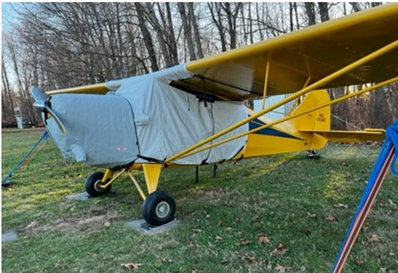
Piper PA-12 Insulated Hangar Blanket Aeronca Super Chief 11CC Extended Over-Top Canopy Cover, Insulated Engine Cover