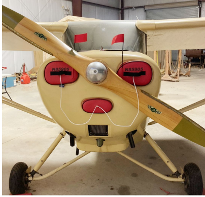
Aeronca 11AC Chief Engine Plugs

Engine Inlet Plugs are custom fit for your Aeronca Chief 11AC, Super Chief 11CC intakes, made with heavy-duty vinyl material, and stuffed with a single block of sculpted urethane foam. Each plug has a zipper that allows the foam to be removed and dried if necessary. Engine plugs have warning flags that are visible from the cockpit or 'remove before flight' streamers sewn onto the face of the plugs. Most plugs are imprinted with the aircraft registration number in black for an extra charge. Storage bag NOT included. Engine plugs may be inserted after flight when the engine is still warm. Engine Inlet Plugs are commonly referred to as Cowl Plugs, Intake Plugs, Cowl Blocks, Engine Blocks, and Engine Bungs.