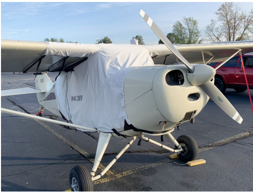
Aeronca Chief 11BC Extended Over-Top Canopy Cover