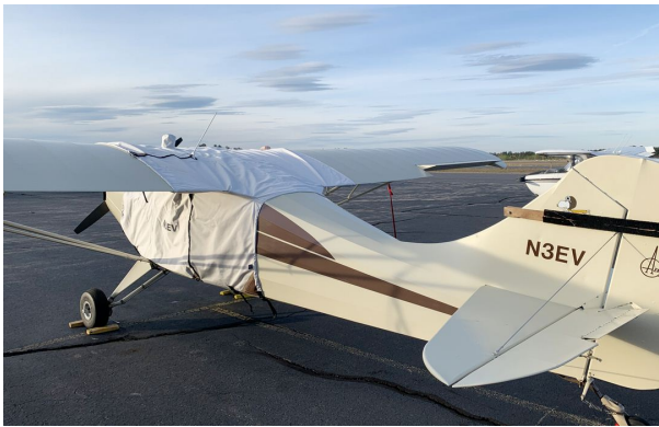
Aeronca Chief 11BC Extended Over-Top Canopy Cover

This cover type is made from Silver Acrylic Sunbrella canvas and is 100% lined with a soft and smooth microfiber. Bruce's Custom Covers developed this material combination especially for aircraft protection. The outer material is medium weight and treated for water resistance, UV resistance and anti-static buildup. The inner lining is a very soft and smooth microfiber to prevent scratching. The material is very reflective, and tests show that the cabin interior temperature can be reduced to near-ambient temperature on the hottest of days. It is water, ice and snow repellent, yet breathable to allow moisture to escape from between the cover and the aircraft surface.