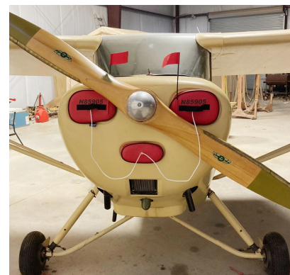
Aeronca 11CC Super Chief Engine Plugs, Extended Canopy Cover (also covers gas caps) Aeronca 11AC Chief Engine Plugs