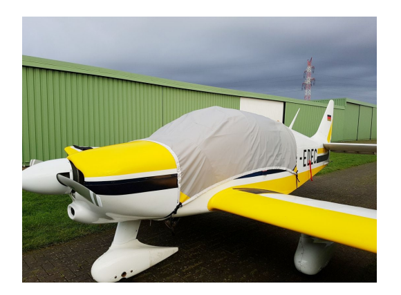
Robin DR400/R Travel Cover, Light Weight Travel Canopy Cover