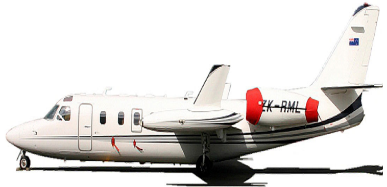
Jet Commander Engine Covers