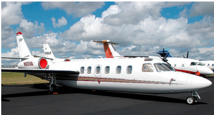
Westwind Engine Intake Plugs

The Engine Inlet Plugs are custom fit for your Israel Aircraft Industries Jet Commander 1121 intakes, made with heavy-duty vinyl material, and stuffed with a single block of sculpted urethane foam. Each plug has a zipper that allows the foam to be removed and dried if necessary. Engine plugs have 'remove before flight' streamers sewn onto the face of the plugs. Most plugs are imprinted with the aircraft registration number in black. Engine plugs may be inserted after flight when the engine is still warm. Engine Inlet Plugs are commonly referred to as Cowl Plugs, Intake Plugs, Cowl Blocks, Engine Blocks, and Engine Bungs.