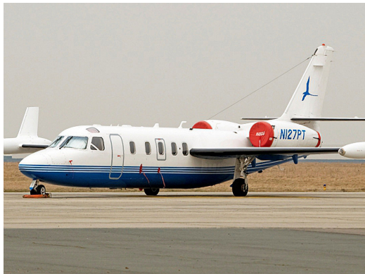
Engine Covers & Cockpit HeatShields

The Israel Aircraft Industries Jet Commander 1121 Bikini Style Engine Covers are a single-piece design using a soft and smooth stretchy and fabric. The cover stretches tightly over both the intake and exhaust, installing quickly and easily. These covers are designed to be used as hangar dust covers and have a useful life of approximately one year.