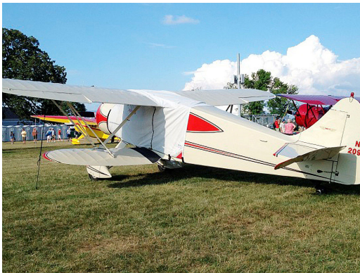
Waco AGC-8 Over-the-Top Canopy Cover