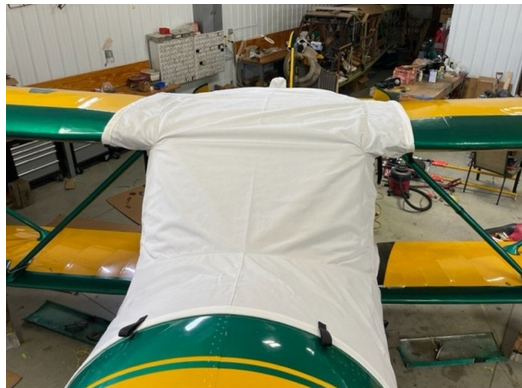
Waco Cabin Biplane Cabin Cover (Over Top Type), Ext. To Cover Baggage Door