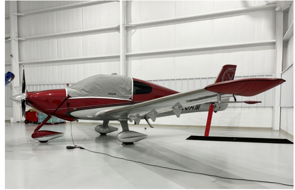
Cirrus SR-22 Cockpit Cover