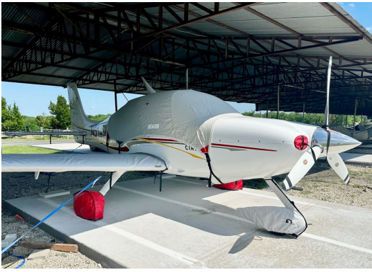
Cirrus SR-22 Wheelpant Covers