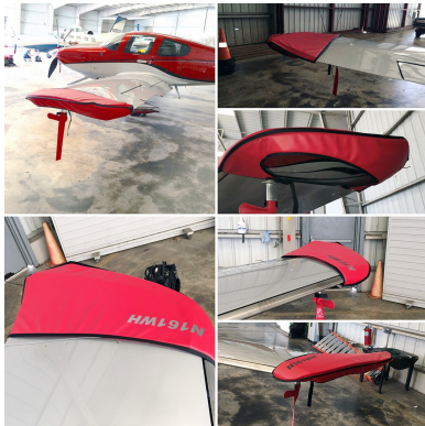
Cirrus SR22 Wingtip Pads, G5 Models

Designed to prevent damage to the aircraft extremities in crowded hangars, these products are made of bright red Naugahyde and thickly padded with a sandwich of closed cell foam. Nowadays they are also made using bright red Neoprene padded laminated (think: wetsuit material).