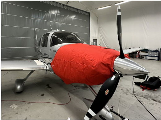
Cirrus SR-22 Insulated Engine Cover

This cover type is made from Silver Acrylic Sunbrella canvas and is 100% lined with a soft and smooth microfiber. Bruce's Custom Covers developed this material combination especially for aircraft protection. The outer material is medium weight and treated for water resistance, UV resistance and anti-static buildup. The inner lining is a very soft and smooth microfiber to prevent scratching. The material is very reflective, and tests show that the cabin interior temperature can be reduced to near-ambient temperature on the hottest of days. It is water, ice and snow repellent, yet breathable to allow moisture to escape from between the cover and the aircraft surface.