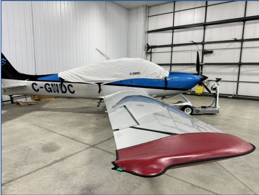
SR22-000: Canopy Cover (extended to cover parachute panel)