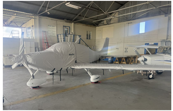
Cirrus SR-20 Complete Cover Set