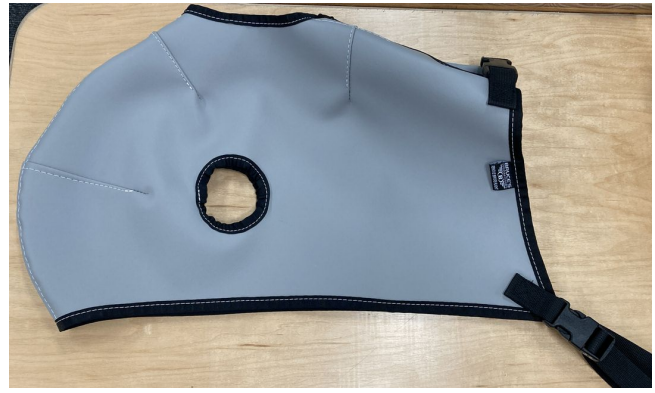
Cirrus SR-22 Wheelpant Cover