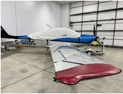
SR22-000: Canopy Cover (extended to cover parachute panel)