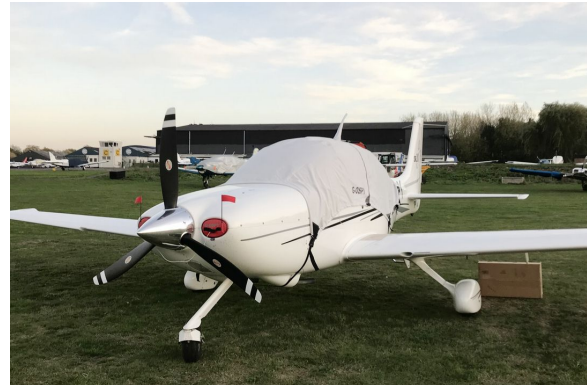
Cirrus SR20 Front Wheelpant/Strut Cover, Engine Plugs Cirrus SR20 G2 GTS Canopy Cover extended to cover parachute panel