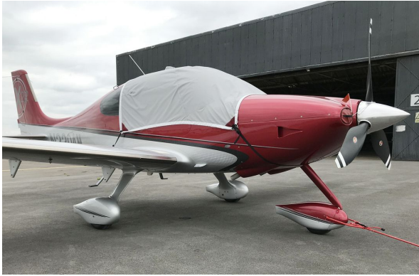
Cirrus SR-22 Cockpit Cover

non-travel Sunbrella Cover is the best choice.