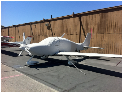
Cirrus SR-22 Full Cover Set

WINTER USE MATERIAL - Made with Solution-Dyed Polyester fabric, this option is intended for seasonal use to aid in deicing, rain mitigation, or for occasional travel. The material is lighter and more compact, but more susceptible to UV damage and may have a shorter useful life if used continuously outside than the all-year use material.