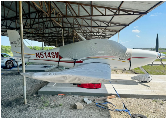
Cirrus SR-22 Canopy, Wing & Wheelpant Covers

Designed to prevent damage to the aircraft extremities in crowded hangars, these products are made of bright red Naugahyde and thickly padded with a sandwich of closed cell foam. Nowadays they are also made using bright red Neoprene padded laminated (think: wetsuit material).