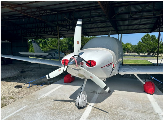
Cirrus SR-22 Wheelpant Covers

WINTER USE MATERIAL - Made with Solution-Dyed Polyester fabric, this option is intended for seasonal use to aid in deicing, rain mitigation, or for occasional travel. The material is lighter and more compact, but more susceptible to UV damage and may have a shorter useful life if used continuously outside than the all-year use material.