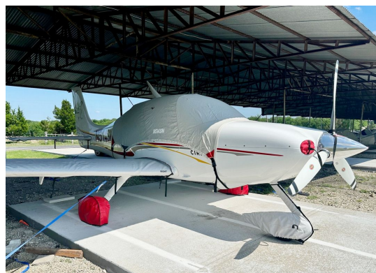
Cirrus SR-22 Wheelpan Cover