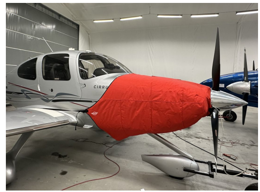
Cirrus SR-22 Insulated Engine Cover