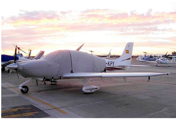
Cirrus SR20 Extended Canopy/Engine Cover