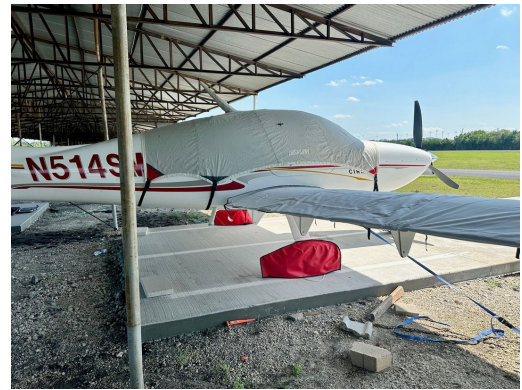
Cirrus SR-22 Canopy, Wing & Wheelpant Covers