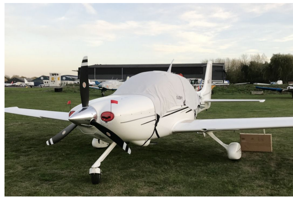
Cirrus SR20 G2 GTS Canopy Cover extended to cover parachute panel