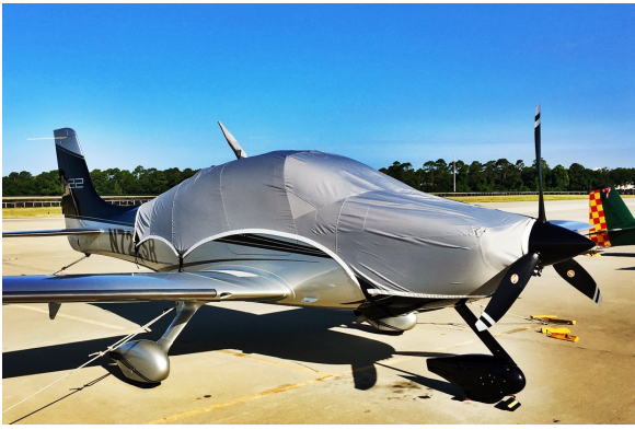
Cirrus SR22 Light Weight Travel Canopy/Engine Cover