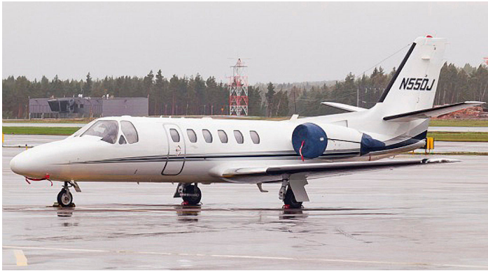
Cessna Citation Bravo Engine Covers and Pitot Covers sets

and dried if necessary. Engine plugs have 'remove before flight' streamers sewn onto the face of the plugs. Most plugs are imprinted with the aircraft registration number in black. Engine plugs may be inserted after flight when the engine is still warm. Engine Inlet Plugs are commonly referred to as Cowl Plugs, Intake Plugs, Cowl Blocks, Engine Blocks, and Engine Bungs.