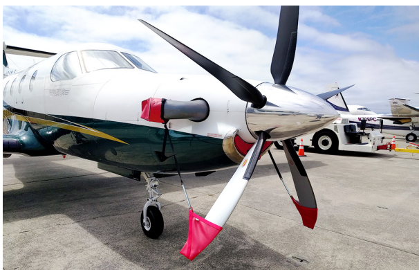
Main Intake Plug and Prop-Tie/Exhaust Covers. (Sold Separately)

Engine Inlet Plugs are custom fit for your Pilatus PC-12, U-28A, NGX intakes, made with heavy-duty vinyl material, and stuffed with a single block of sculpted urethane foam. Each plug has a zipper that allows the foam to be removed and dried if necessary. Engine plugs have warning flags that are visible from the cockpit or 'remove before flight' streamers sewn onto the face of the plugs. Most plugs are imprinted with the aircraft registration number in black for an extra charge. Storage bag NOT included. Engine plugs may be inserted after flight when the engine is still warm. Engine Inlet Plugs are commonly referred to as Cowl Plugs, Intake Plugs, Cowl Blocks, Engine Blocks, and Engine Bungs.