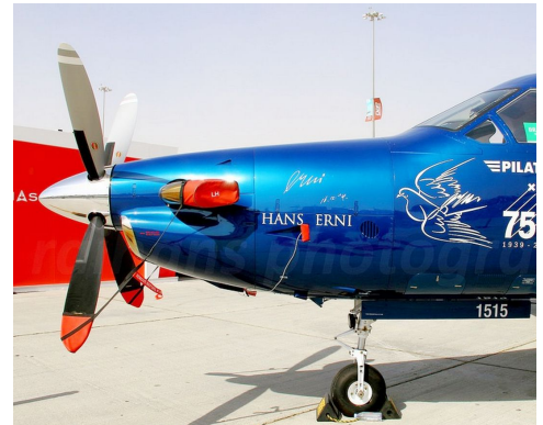
Pilatus PC-12 Prop Tie/Exhaust Covers