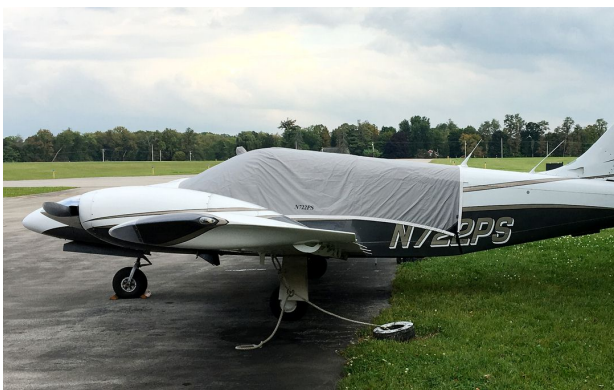
Piper Seneca Light Weight Travel Canopy Cover

Travel Covers are made with Silver Solution-Dyed Polyester fabric and only lined over the windshield to save weight. The material is lightweight and more compact for easy stowage in the aircraft. The polyester material is water resistant, but only intended for occasional use outside. We also have an ultra lightweight material available for fitted hangar dust covers. For daily outdoor use, the non-travel Sunbrella Cover is the best choice.