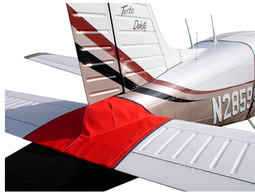
Piper PA-28 Tailcone Cover

WINTER USE MATERIAL - Made with Solution-Dyed Polyester fabric, this option is intended for seasonal use to aid in deicing, rain mitigation, or for occasional travel. The material is lighter and more compact, but more susceptible to UV damage and may have a shorter useful life if used continuously outside than the all-year use material.