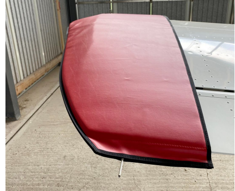
Piper PA-34 Seneca Wingtip Pads