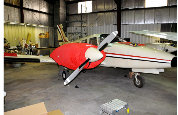
Piper Seneca Insulated Engine Covers