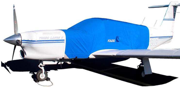
Piper PA-32 Models Extended Canopy Cover

water resistance, UV resistance and anti-static buildup. The inner lining is a very soft and smooth microfiber to prevent scratching. The material is very reflective, and tests show that the cabin interior temperature can be reduced to near-ambient temperature on the hottest of days. It is water, ice and snow repellent, yet breathable to allow moisture to escape from between the cover and the aircraft surface.