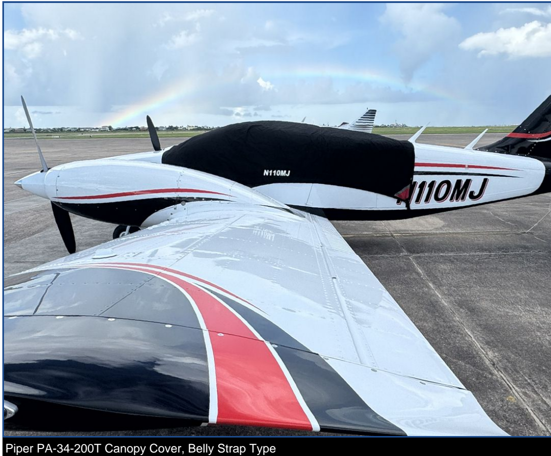
Piper PA-34-200T Canopy Cover, Belly Strap Type