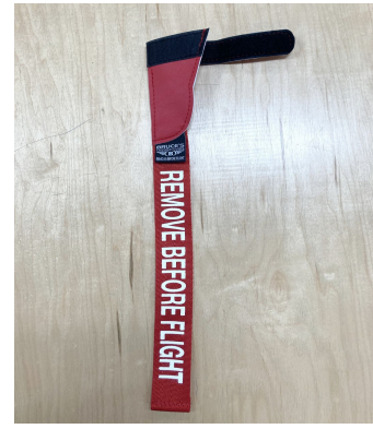
Piper Style Pitot Tube Cover, with Velcro Strap