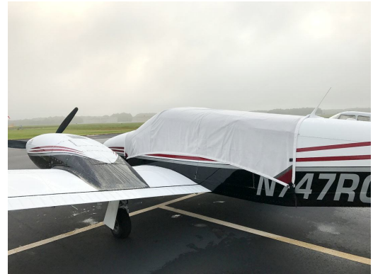
Piper PA-34 Seneca Canopy Cover, Belly Strap Type