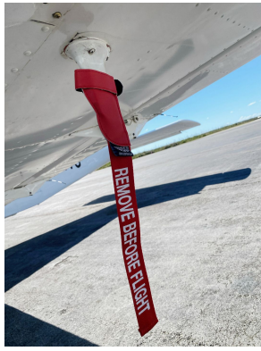
Piper PA-34-200T Pitot Cover (Original Straight Blade Type)