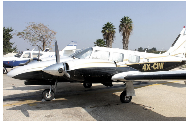
Piper Seneca Windshield & Cabin HeatShields

Windshield Heatshields are interior sunshades for an aircraft's front windshield. The product is a unique composite of closed-cell foam with a silver mylar finish. The semi-rigid design is stiff enough to stand along the inside of the windshield using sun visors or window framing. It folds up flat and easily stores in the included storage sleeve. Some designs may require velcro and suction cups or split right and left sides. A Heatshield is an excellent short-term remedy for cockpit overheating. An external fabric cover is far more effective and practical for long-term protection.