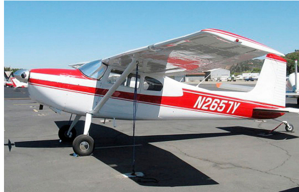
Cessna 180 & 185 Windshield HeatShield

Windshield Heatshields are interior sunshades for an aircraft's front windshield. The product is a unique composite of closed-cell foam with a silver mylar finish. The semi-rigid design is stiff enough to stand along the inside of the windshield using sun visors or window framing. It folds up flat and easily stores in the included storage sleeve. Some designs may require velcro and suction cups or split right and left sides. A Heatshield is an excellent short-term remedy for cockpit overheating. An external fabric cover is far more effective and practical for long-term protection.