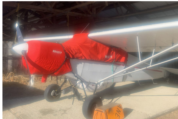
Piper PA-18 Super Cub Insulated Engine Cover, Canopy Cover