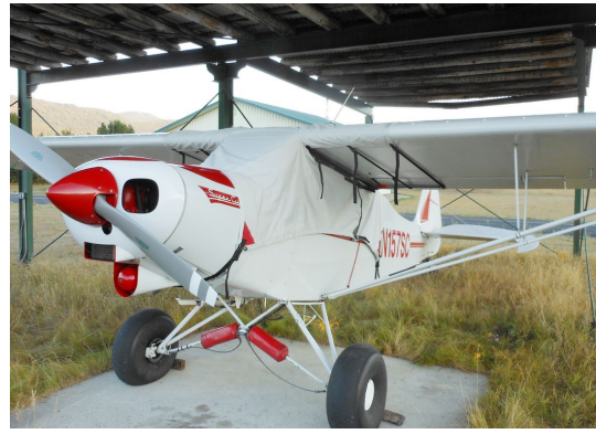
Piper PA-18 Super Cub Canopy Cover, Extends To Cover Gas Caps