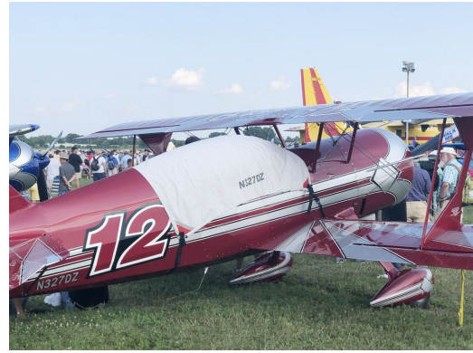
Pitts Model 12 Canopy Cover