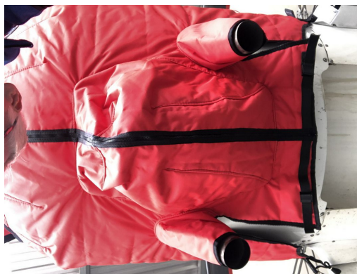
Pitts Model 12 Insulated Engine Cover