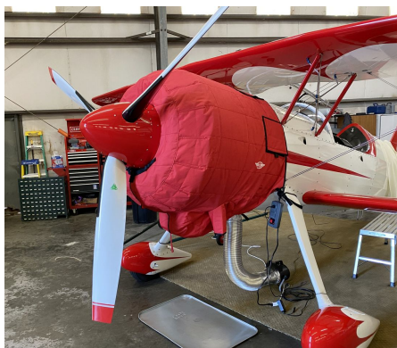
Pitts Model 12 Insulated Engine Cover

Covers developed this material combination especially for aircraft protection. The outer material is medium weight and treated for water resistance, UV resistance and anti-static buildup. The inner lining is a very soft and smooth microfiber to prevent scratching. The material is very reflective, and tests show that the cabin interior temperature can be reduced to near-ambient temperature on the hottest of days. It is water, ice and snow repellent, yet breathable to allow moisture to escape from between the cover and the aircraft surface.