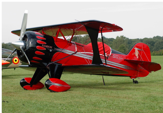
Pitts Samson II Canopy Cover

Travel Covers are made with Silver Solution-Dyed Polyester fabric and only lined over the windshield to save weight. The material is lightweight and more compact for easy stowage in the aircraft. The polyester material is water resistant, but only intended for occasional use outside. We also have an ultra lightweight material available for fitted hangar dust covers. For daily outdoor use, the non-travel Sunbrella Cover is the best choice.