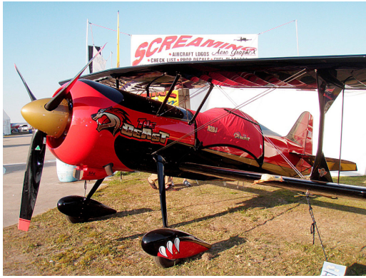
Pitts Model 12 Canopy Cover, single seat

the hottest of days. It is water, ice and snow repellent, yet breathable to allow moisture to escape from between the cover and the aircraft surface.