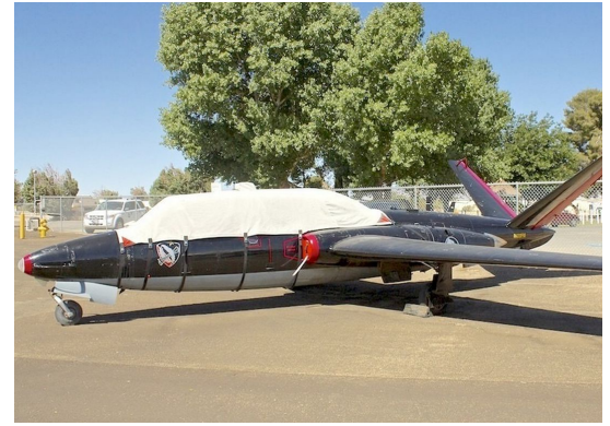
Fougas Magister Canopy Cover, Engine Plugs