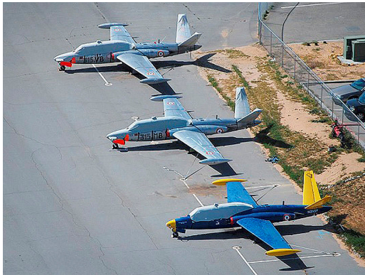
Fouga Magister Canopy Cover, Canopy/Nose Covers and Tail Stabilizer Covers

This cover type is made from Silver Acrylic Sunbrella canvas and is 100% lined with a soft and smooth microfiber. Bruce's Custom Covers developed this material combination especially for aircraft protection. The outer material is medium weight and treated for water resistance, UV resistance and anti-static buildup. The inner lining is a very soft and smooth microfiber to prevent scratching. The material is very reflective, and tests show that the cabin interior temperature can be reduced to near-ambient temperature on the hottest of days. It is water, ice and snow repellent, yet breathable to allow moisture to escape from between the cover and the aircraft surface.