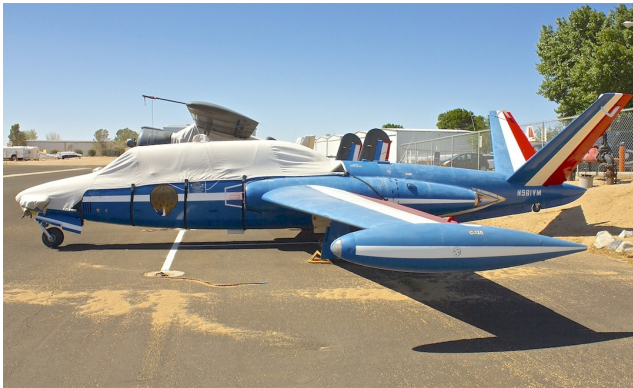
Fouga Magister Canopy/Nose Cover

Travel Covers are made with Silver Solution-Dyed Polyester fabric and only lined over the windshield to save weight. The material is lightweight and more compact for easy stowage in the aircraft. The polyester material is water resistant, but only intended for occasional use outside. We also have an ultra lightweight material available for fitted hangar dust covers. For daily outdoor use, the non-travel Sunbrella Cover is the best choice.