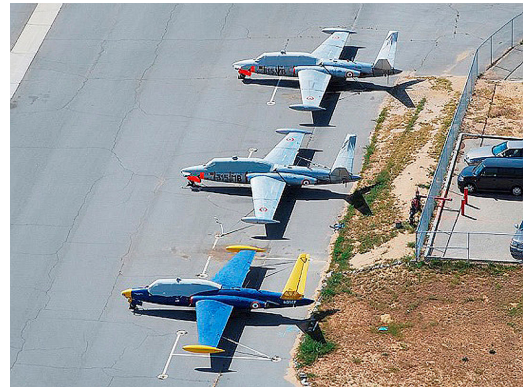
Fouga Magister Canopy Cover, Canopy/Nose Covers and Tail Stabilizer Covers