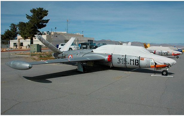
Fouga Magister Canopy/Nose Cover & Tail Stabilizer Covers