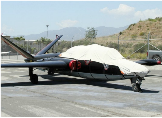
Fougas Magister Canopy/Nose Cover with nose mount loop antenna

engine is still warm. Engine Inlet Plugs are commonly referred to as Cowl Plugs, Intake Plugs, Cowl Blocks, Engine Blocks, and Engine Bunges.