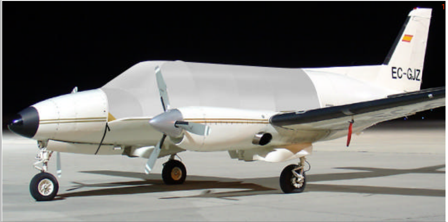
Merlin Canopy Cover (illustration)

Canopy covers help reduce damage to your airplane's upholstery and avionics caused by excessive heat, and they can eliminate problems caused by leaky door and window seals. They keep the windshield and window surfaces clean and help prevent vandalism and theft.