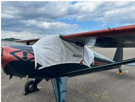
Luscombe Canopy Cover, Over-Top Type

This cover type is made from Silver Acrylic Sunbrella canvas and is 100% lined with a soft and smooth microfiber. Bruce's Custom Covers developed this material combination especially for aircraft protection. The outer material is medium weight and treated for water resistance, UV resistance and anti-static buildup. The inner lining is a very soft and smooth microfiber to prevent scratching. The material is very reflective, and tests show that the cabin interior temperature can be reduced to near-ambient temperature on the hottest of days. It is water, ice and snow repellent, yet breathable to allow moisture to escape from between the cover and the aircraft surface.