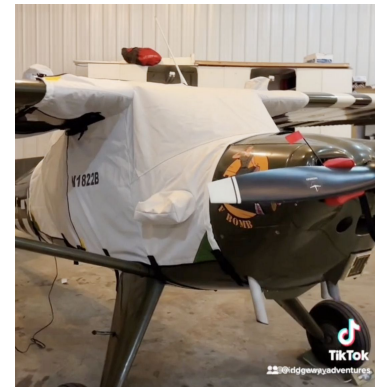
Luscombe T-8F Canopy Cover