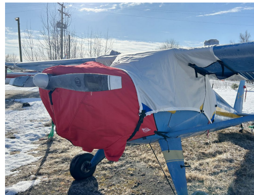
Luscombe 8A Canopy Cover, Insulated Engine Cover Luscombe 8E Canopy Cover w/Wing Extensions, Insulated Engine Cover