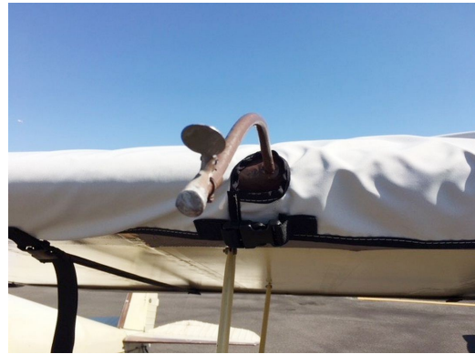
Luscombe 8A-8F Silvaire Wing Covers, Pitot Tube detail.