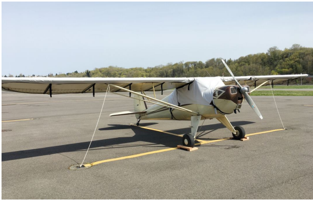
Luscombe Over-Top Canopy Cover & Wing Covers

WINTER USE MATERIAL - Made with Solution-Dyed Polyester fabric, this option is intended for seasonal use to aid in deicing, rain mitigation, or for occasional travel. The material is lighter and more compact, but more susceptible to UV damage and may have a shorter useful life if used continuously outside than the all-year use material.