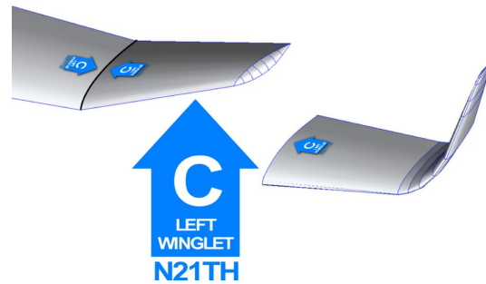
Blanik L23 Wing & Horizontal Stabilizer Covers