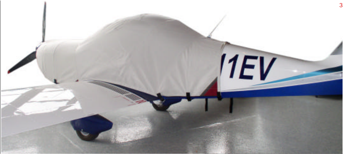
Evezor Sportstar Extended Canopy/Engine Cover (aft view)