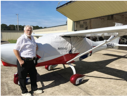
Jabiru 230SP Canopy Cover, Over-Top Style