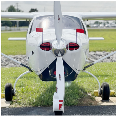
Jabiru J230-SP Engine Inlet Plugs