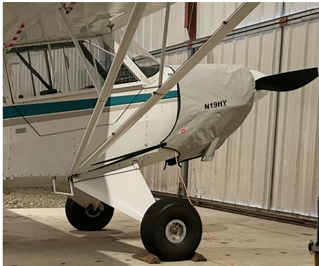
Aviat Husky A-1A Insulated Engine Cover

This cover type is made from Silver Acrylic Sunbrella canvas and is 100% lined with a soft and smooth microfiber. Bruce's Custom Covers developed this material combination especially for aircraft protection. The outer material is medium weight and treated for water resistance, UV resistance and anti-static buildup. The inner lining is a very soft and smooth microfiber to prevent scratching. The material is very reflective, and tests show that the cabin interior temperature can be reduced to near-ambient temperature on the hottest of days. It is water, ice and snow repellent, yet breathable to allow moisture to escape from between the cover and the aircraft surface.