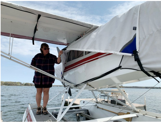
Aviat Husky Canopy, Wing, Empennage Covers

This cover type is made from Silver Acrylic Sunbrella canvas and is 100% lined with a soft and smooth microfiber. Bruce's Custom Covers developed this material combination especially for aircraft protection. The outer material is medium weight and treated for water resistance, UV resistance and anti-static buildup. The inner lining is a very soft and smooth microfiber to prevent scratching. The material is very reflective, and tests show that the cabin interior temperature can be reduced to near-ambient temperature on the hottest of days. It is water, ice and snow repellent, yet breathable to allow moisture to escape from between the cover and the aircraft surface.