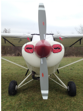
Aviat Husky Engine Plugs, Wing Covers

Engine Inlet Plugs are custom fit for your Aviat (Christen) Husky intakes, made with heavy-duty vinyl material, and stuffed with a single block of sculpted urethane foam. Each plug has a zipper that allows the foam to be removed and dried if necessary. Engine plugs have warning flags that are visible from the cockpit or 'remove before flight' streamers sewn onto the face of the plugs. Most plugs are imprinted with the aircraft registration number in black for an extra charge. Storage bag NOT included. Engine plugs may be inserted after flight when the engine is still warm. Engine Inlet Plugs are commonly referred to as Cowl Plugs, Intake Plugs, Cowl Blocks, Engine Blocks, and Engine Bungs.