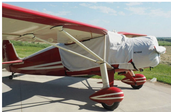
Fairchild 24W Canopy, Engine & Prop Cover