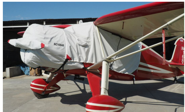
Fairchild 24W Canopy, Engine & Prop Cover