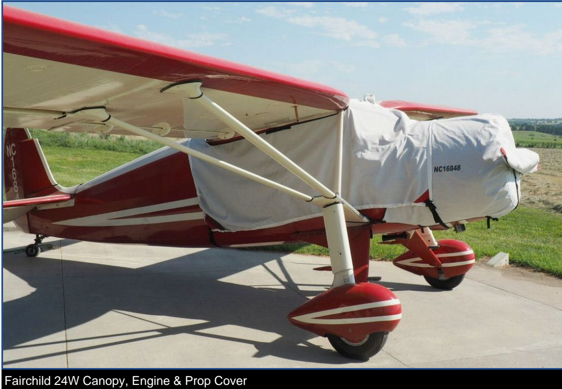
Fairchild 24W Canopy, Engine &amp; Prop Cover