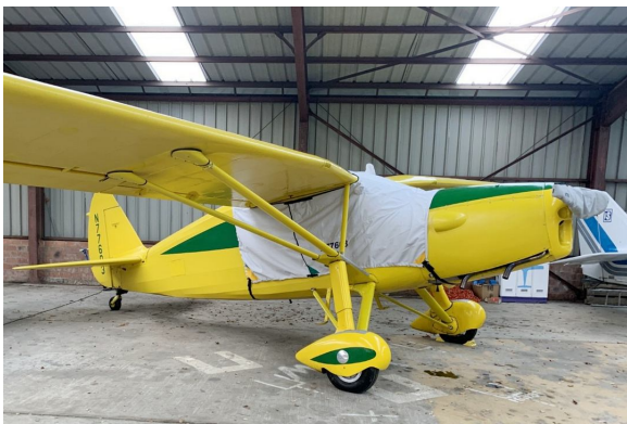
Fairchild 24 Over-Top Canopy Cover, Prop Cover

This cover type is made from Silver Acrylic Sunbrella canvas and is 100% lined with a soft and smooth microfiber. Bruce's Custom Covers developed this material combination especially for aircraft protection. The outer material is medium weight and treated for water resistance, UV resistance and anti-static buildup. The inner lining is a very soft and smooth microfiber to prevent scratching. The material is very reflective, and tests show that the cabin interior temperature can be reduced to near-ambient temperature on the hottest of days. It is water, ice and snow repellent, yet breathable to allow moisture to escape from between the cover and the aircraft surface.