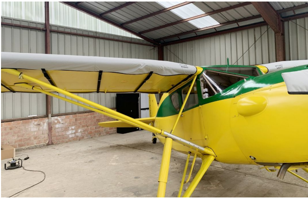
Fairchild 24 Wing Covers