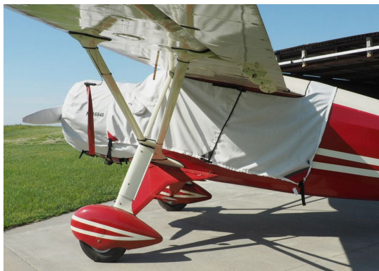
Fairchild 24W Canopy & Engine Cover

This cover type is made from Silver Acrylic Sunbrella canvas and is 100% lined with a soft and smooth microfiber. Bruce's Custom Covers developed this material combination especially for aircraft protection. The outer material is medium weight and treated for water resistance, UV resistance and anti-static buildup. The inner lining is a very soft and smooth microfiber to prevent scratching. The material is very reflective, and tests show that the cabin interior temperature can be reduced to near-ambient temperature on the hottest of days. It is water, ice and snow repellent, yet breathable to allow moisture to escape from between the cover and the aircraft surface.