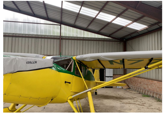
Fairchild 24 Wing Covers