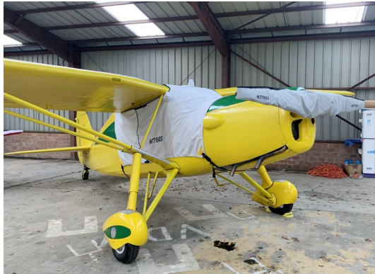
Fairchild 24 Over-Top Canopy Cover

Travel Covers are made with Silver Solution-Dyed Polyester fabric and only lined over the windshield to save weight. The material is lightweight and more compact for easy stowage in the aircraft. The polyester material is water resistant, but only intended for occasional use outside. We also have an ultra lightweight material available for fitted hangar dust covers. For daily outdoor use, the non-travel Sunbrella Cover is the best choice.