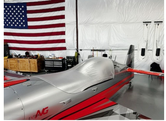
Extra NG Models Canopy Cover