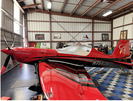
Gamebird GB-1 Solar Cap (single place), CUSTOM COVERS & IMPRINTING AVAILABLE!

The material is very reflective, and tests show that the cabin interior temperature can be reduced to near-ambient temperature on the hottest of days. It is water, ice and snow repellent, yet breathable to allow moisture to escape from between the cover and the aircraft surface.