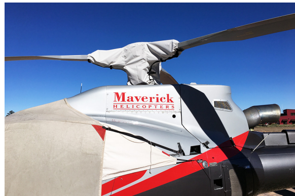
Eurocopter EC-130 Main Rotor Hub Cover