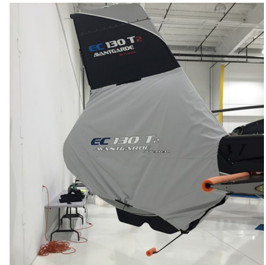
EC-130 Tailfan Cover