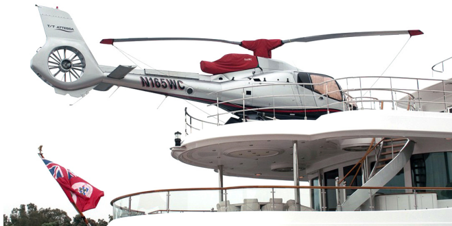
Intake/Exhaust Cover, Rotor Hub Cover (w/ skirt) & Blade Tie Downs

circulation and drainage in freezing weather. Some part numbers have features for an extra charge.