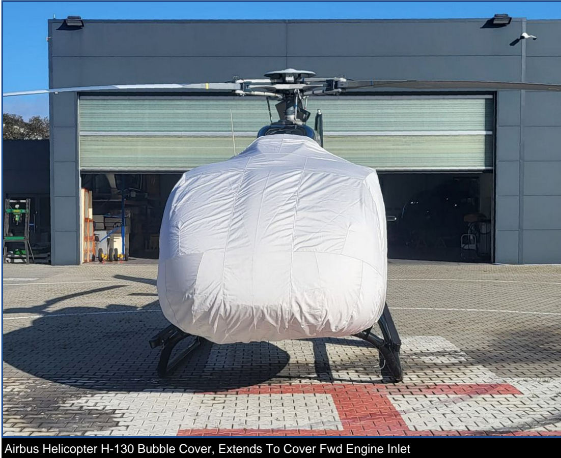
Airbus Helicopter H-130 Bubble Cover, Extends To Cover Fwd Engine Inlet