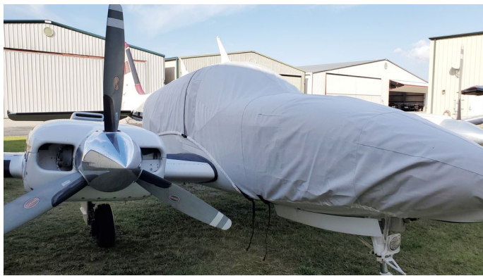
Beech Baron 58 Canopy/Nose Cover