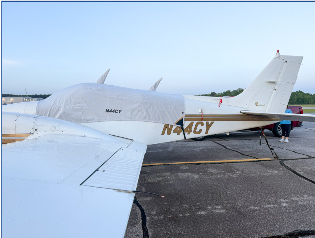
Beech Baron B55 Canopy Cover