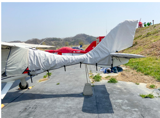
Flight Design CTSW, CTLS, 2K, MC & F2 Empennage Cover (Tailboom, Vertical & Horiz Stabilizers), Ctsw Model, All Year Use

WINTER USE MATERIAL - Made with Solution-Dyed Polyester fabric, this option is intended for seasonal use to aid in deicing, rain mitigation, or for occasional travel. The material is lighter and more compact, but more susceptible to UV damage and may have a shorter useful life if used continuously outside than the all-year use material.