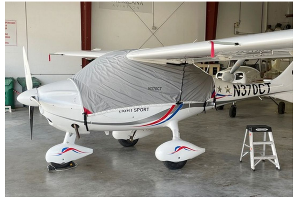
Flight Design CTLS Travel Cover