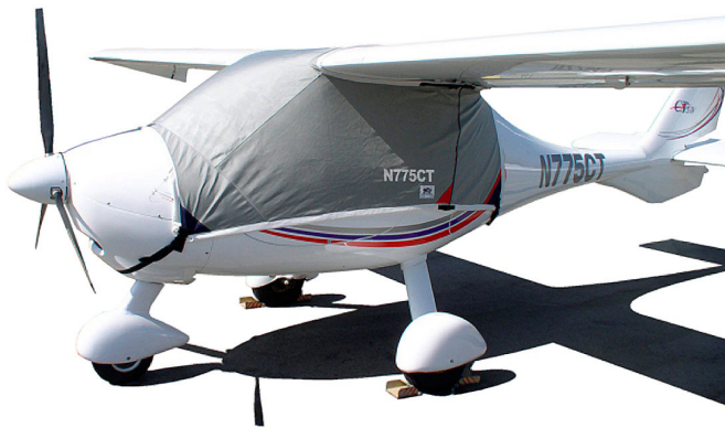
Flight Design CTSW Canopy Cover

This cover type is made from Silver Acrylic Sunbrella canvas and is 100% lined with a soft and smooth microfiber. Bruce's Custom Covers developed this material combination especially for aircraft protection. The outer material is medium weight and treated for water resistance, UV resistance and anti-static buildup. The inner lining is a very soft and smooth microfiber to prevent scratching. The material is very reflective, and tests show that the cabin interior temperature can be reduced to near-ambient temperature on the hottest of days. It is water, ice and snow repellent, yet breathable to allow moisture to escape from between the cover and the aircraft surface.