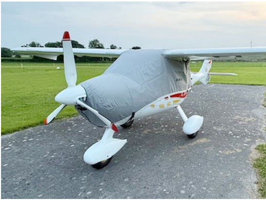
Flight Design CTSW Canopy/Engine Cover, Travel Weight Design

Travel Covers are made with Silver Solution-Dyed Polyester fabric and only lined over the windshield to save weight. The material is lightweight and more compact for easy stowage in the aircraft. The polyester material is water resistant, but only intended for occasional use outside. We also have an ultra lightweight material available for fitted hangar dust covers. For daily outdoor use, the non-travel Sunbrella Cover is the best choice.