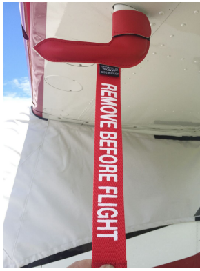
Cessna A185F Pitot Cover