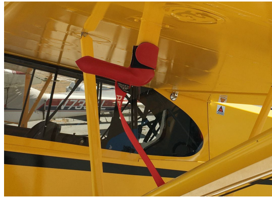
Cub Crafters CC-11 Carbon Cub Pitot Cover