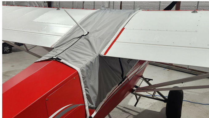
CubCrafters Carbon Cub Travel Canopy Cover