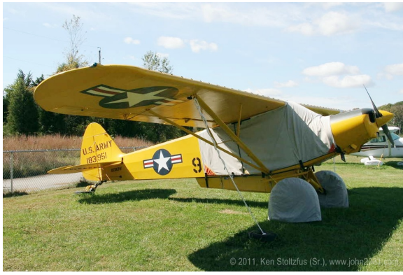
Piper L-21b Extended Canopy Cover, Tire Covers