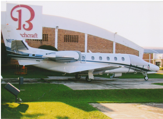
Citation XL Cockpit Cover & Bikini Type Engine Cover

The Cessna Citation VII (650) Intake/Exhaust Plugs are custom fit for the intake and exhaust openings, made with heavy-duty vinyl material, and stuffed with a single block of sculpted urethane foam. Each plug has a zipper that allows the foam to be removed and dried if necessary. Engine plugs have 'remove before flight' streamers sewn onto the face of the plugs. Most plugs are imprinted with the aircraft registration number in black. Engine plugs may be inserted after flight when the engine is still warm. Engine Inlet Plugs are commonly referred to as Cowl Plugs, Intake Plugs, Cowl Blocks, Engine Blocks, and Engine Bungs.