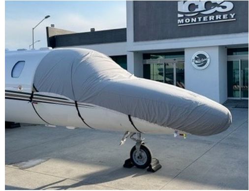
Cessna Citation Windshield Cover, Engine Cover set and Pitot Covers Cessna Citationjet 525B Travel Weight Cockpit/Nose Cover