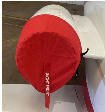
Cessna 501 Engine Covers NO TR's

The Cessna Citation I (500/501) Intake Covers are designed to install easily yet be completely storable. A spring steel hoop is sewn into the hem of each cover, allowing them to be installed without climbing onto the wing or using a stepladder. To store the covers the spring steel hoop folds like a band-saw blade into three nesting rings. Each cover folds into a compact circular bundle which is stored in the included duffle bag, yet they unfold quickly for use. The Tri-Fold Ring cover is made of medium weight nylon which is available in a variety of colors to match the paint trim. Each cover set comes complete with installation and folding instructions. The aircraft's registration number can be silkscreened onto the cover for an extra charge.