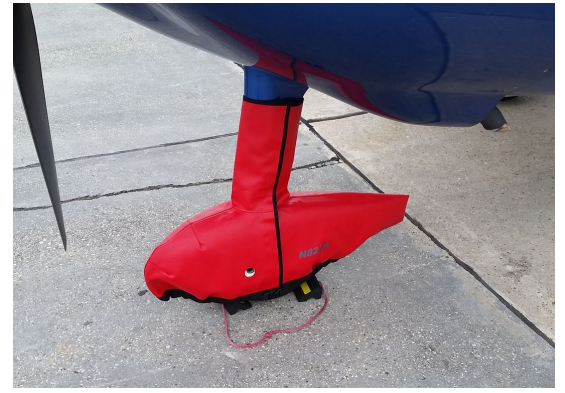
Lancair Columbia Nose Wheelpant/Strut Cover