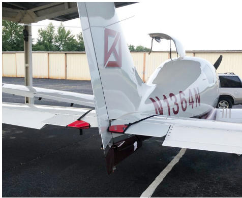
Lancair Columbia Rudder Gust Pad

Engine Inlet Plugs are custom fit for your Cessna Corvalis, Corvalis TT, Models T240, 350 & 400 intakes, made with heavy-duty vinyl material, and stuffed with a single block of sculpted urethane foam. Each plug has a zipper that allows the foam to be removed and dried if necessary. Engine plugs have warning flags that are visible from the cockpit or 'remove before flight' streamers sewn onto the face of the plugs. Most plugs are imprinted with the aircraft registration number in black for an extra charge. Storage bag NOT included. Engine plugs may be inserted after flight when the engine is still warm. Engine Inlet Plugs are commonly referred to as Cowl Plugs, Intake Plugs, Cowl Blocks, Engine Blocks, and Engine Bung s. Designed to prevent damage to the aircraft extremities in crowded hangars, these products are made of bright red Naugahyde and thickly padded with a sandwich of closed cell foam. Nowadays they are also made using bright red Neoprene padded laminated (think: wetsuit material).