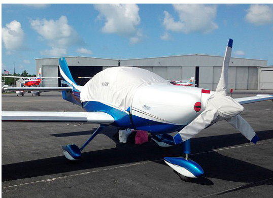
Propellor/Spinner Cover, 3-Blade

This cover type is made from Silver Acrylic Sunbrella canvas and is 100% lined with a soft and smooth microfiber. Bruce's Custom Covers developed this material combination especially for aircraft protection. The outer material is medium weight and treated for water resistance, UV resistance and anti-static buildup. The inner lining is a very soft and smooth microfiber to prevent scratching. The material is very reflective, and tests show that the cabin interior temperature can be reduced to near-ambient temperature on the hottest of days. It is water, ice and snow repellent, yet breathable to allow moisture to escape from between the cover and the aircraft surface.