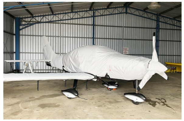
Columbia 350 Full Cover Set