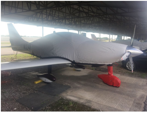
Lancair Columbia Extended Canopy/Engine Cover, Nose Wheelpant Cover