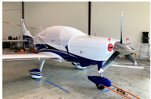
Cessna TTX Cover and Plugs