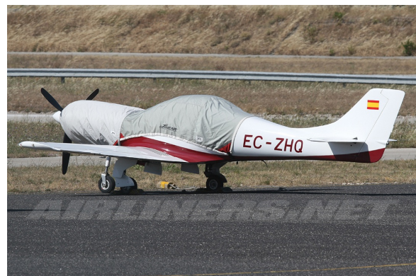
Lancair 360 Canopy Cover, Engine Cover