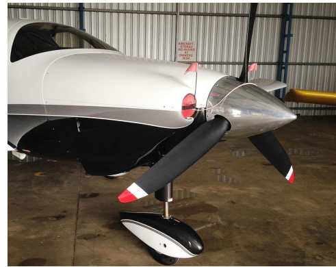
Columbia 350 Engine Plugs