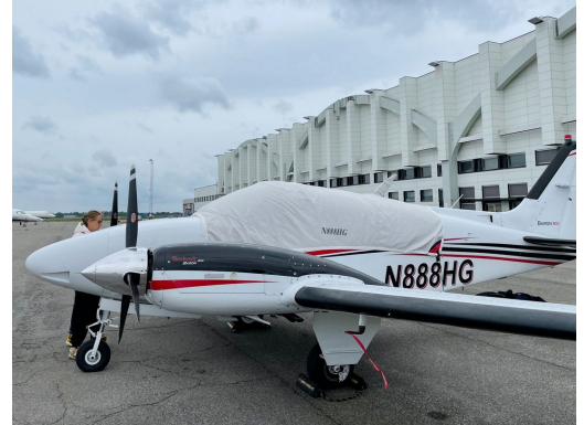
Beech Baron B55 Canopy Cover