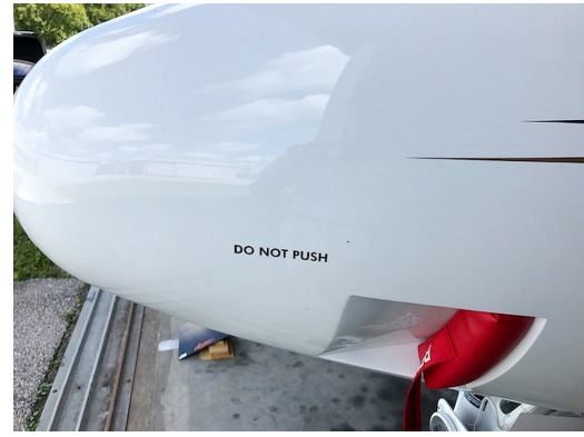
Beech Baron Nose Air Inlet Plugs, set of 2