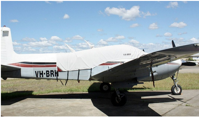
Twin Bonanza Canopy Cover, extends to cover air stair.