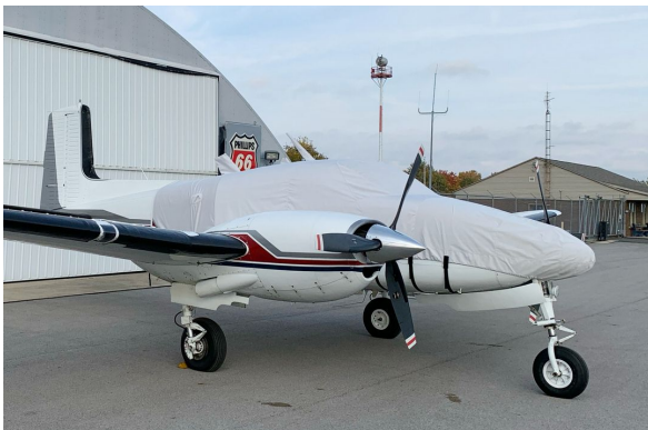
Beech Twin Bonanza Canopy/Nose Cover

This cover type is made from Silver Acrylic Sunbrella canvas and is 100% lined with a soft and smooth microfiber. Bruce's Custom Covers developed this material combination especially for aircraft protection. The outer material is medium weight and treated for water resistance, UV resistance and anti-static buildup. The inner lining is a very soft and smooth microfiber to prevent scratching. The material is very reflective, and tests show that the cabin interior temperature can be reduced to near-ambient temperature on the hottest of days. It is water, ice and snow repellent, yet breathable to allow moisture to escape from between the cover and the aircraft surface.