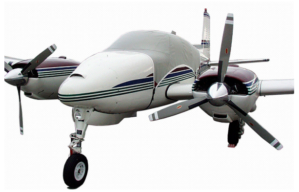
Twin Bonanza Standard Canopy Cover