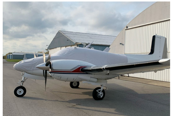
Beech Twin Bonanza Canopy/Nose Cover