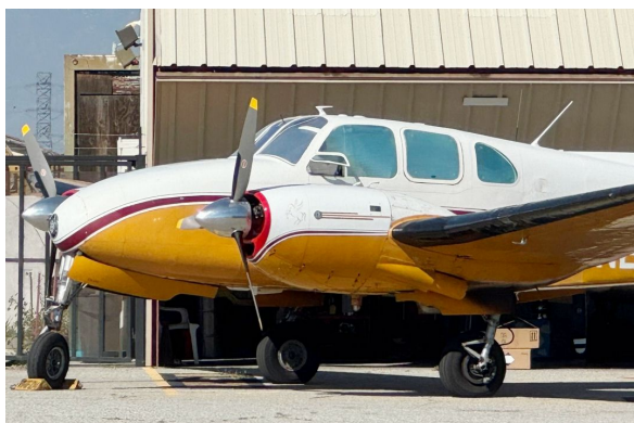
Beech B50 Twin Bonanza Cabin HeatShield Set