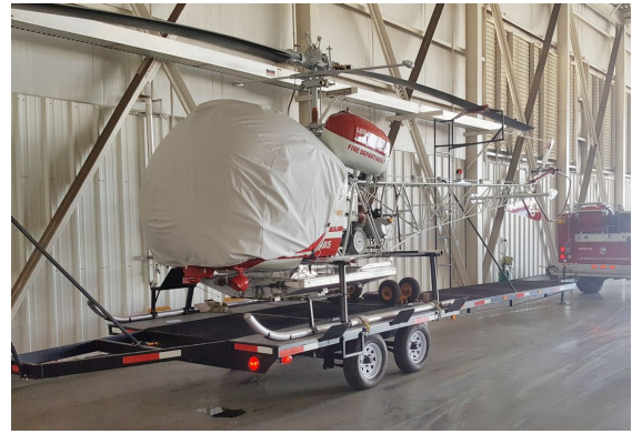
Bell 47G Bubble Cover