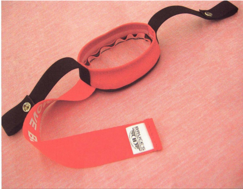
Beech 36TC Turbocharger Inlet Cover, snap-on

The Beech Bonanza 36 Models Tailcone Cover fits onto the tailcone area to cover the holes that birds can fly into and nest. The cover easily straps onto the leading edge of the horizontal stabilizer with padded hooks or overlaps with the elevators slightly and attaches under the horizontal stabilizers with adjustable straps. Tailcone Covers are normally made with Solution-Dyed Polyester or Acrylic Sunbrella .