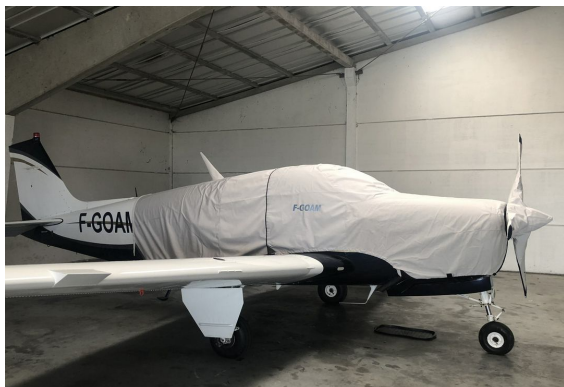
Beech Bonanza A-36 Extended Canopy/Engine Cover, 3-Blade Prop Cover

This cover type is made from Silver Acrylic Sunbrella canvas and is 100% lined with a soft and smooth microfiber. Bruce's Custom Covers developed this material combination especially for aircraft protection. The outer material is medium weight and treated for water resistance, UV resistance and anti-static buildup. The inner lining is a very soft and smooth microfiber to prevent scratching. The material is very reflective, and tests show that the cabin interior temperature can be reduced to near-ambient temperature on the hottest of days. It is water, ice and snow repellent, yet breathable to allow moisture to escape from between the cover and the aircraft surface.