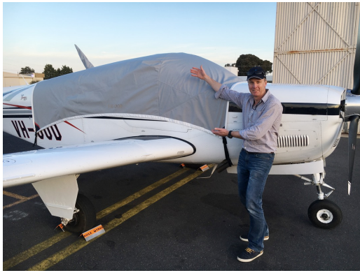
Beech Bonanza Light Weight Travel Canopy Cover