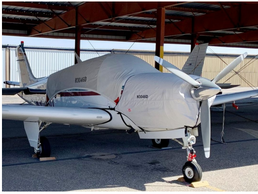
Beech A36 Engine Cover