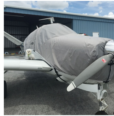
Beech Bonanza V35A Travel Canopy/Engine Cover