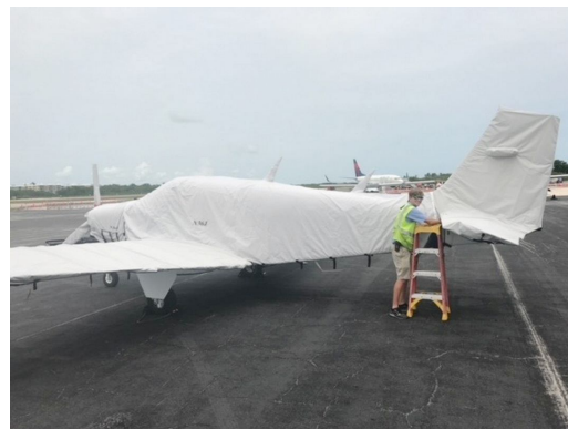
Beech Bonanza G36 Complete Cover Set