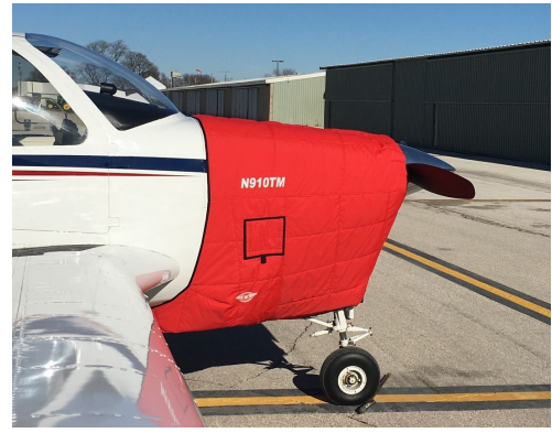
Beech Debonair Insulated Engine Cover