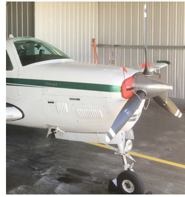
Beech Bonanza Engine Inlet Plugs