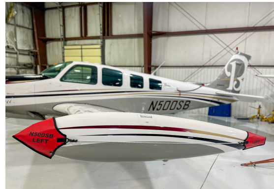
Beech A36 Fresh Air Inlet/Exhaust Plugs Tip Tank Safety Pads Beech A36 Fresh Air Inlet/Exhaust Plugs Tip Tank Safety Pads