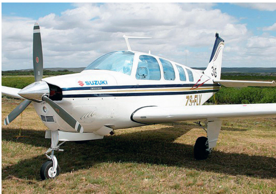
Bonanza A36 HeatShield Set

Windshield Heatshields are interior sunshades for an aircraft's front windshield. The product is a unique composite of closed-cell foam with a silver mylar finish. The semi-rigid design is stiff enough to stand along the inside of the windshield using sun visors or window framing. It folds up flat and easily stores in the included storage sleeve. Some designs may require velcro and suction cups or split right and left sides. A Heatshield is an excellent short-term remedy for cockpit overheating. An external fabric cover is far more effective and practical for long-term protection.