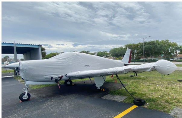
Beech Bonanza A36 Extended Canopy/Engine & Wing Covers

WINTER USE MATERIAL - Made with Solution-Dyed Polyester fabric, this option is intended for seasonal use to aid in deicing, rain mitigation, or for occasional travel. The material is lighter and more compact, but more susceptible to UV damage and may have a shorter useful life if used continuously outside than the all-year use material.