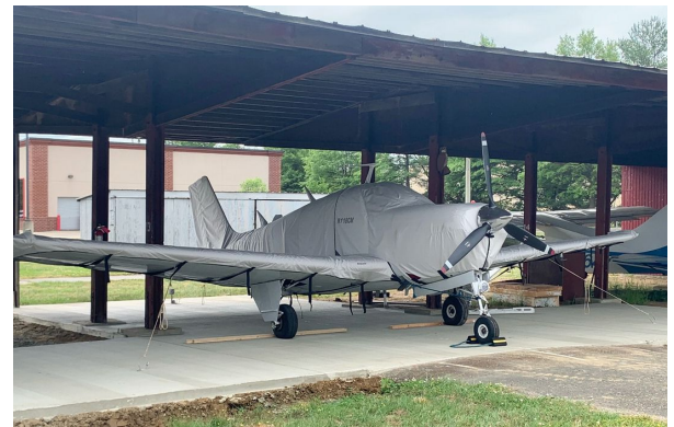
Beech Bonanza F33A Cover Set