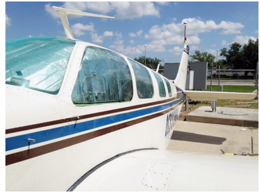
Beech Bonanza HeatShields