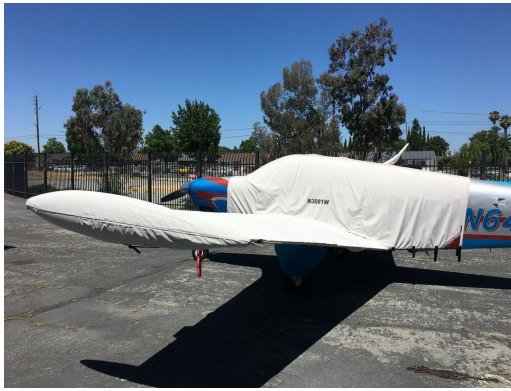
Beech Bonanza A36 Wing Covers with D'Shannon Tip Tanks, Extended Canopy Cover