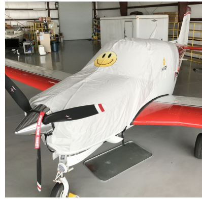
Beech Bonanza/Debonair Extended Canopy Cover (With a Smiley Face)