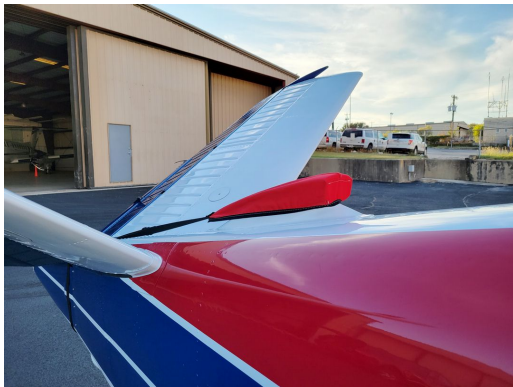
Beech Bonanza Fresh Air Intake Cover

The Beech Bonanza/Debonair Tailcone Cover fits onto the tailcone area to cover the holes that birds can fly into and nest. The cover easily straps onto the leading edge of the horizontal stabilizer with padded hooks or overlaps with the elevators slightly and attaches under the horizontal stabilizers with adjustable straps. Tailcone Covers are normally made with Solution-Dyed Polyester or Acrylic Sunbrella .