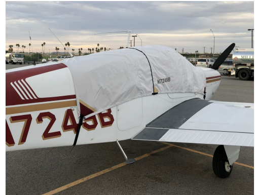
Beech J35 Bonanza Canopy Cover