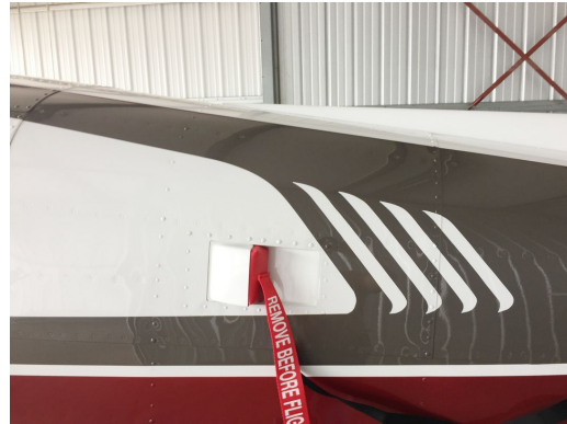
Beech Bonanza/Baron Fresh Air Intake & Exhaust Plugs