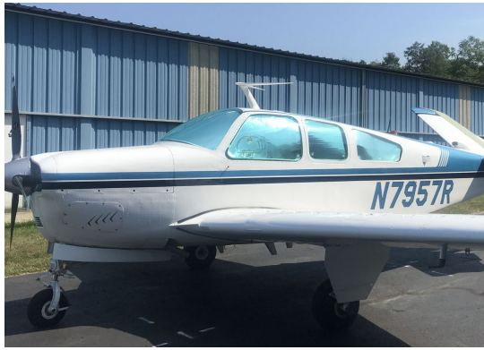
Beechcraft V35A Bonanza Heatshield Set