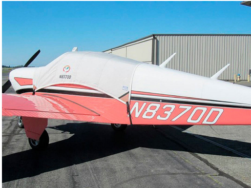
Beech Bonanza Canopy Cover

Travel Covers are made with Silver Solution-Dyed Polyester fabric and only lined over the windshield to save weight. The material is lightweight and more compact for easy stowage in the aircraft. The polyester material is water resistant, but only intended for occasional use outside. We also have an ultra lightweight material available for fitted hangar dust covers. For daily outdoor use, the non-travel Sunbrella Cover is the best choice.