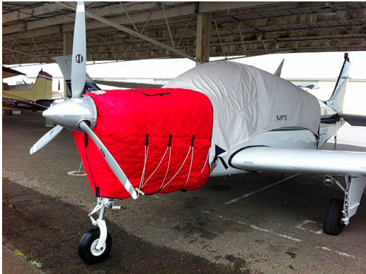
Beech Bonanza Insulated Engine Cover, fully enclosed

This cover type is made from Silver Acrylic Sunbrella canvas and is 100% lined with a soft and smooth microfiber. Bruce's Custom Covers developed this material combination especially for aircraft protection. The outer material is medium weight and treated for water resistance, UV resistance and anti-static buildup. The inner lining is a very soft and smooth microfiber to prevent scratching. The material is very reflective, and tests show that the cabin interior temperature can be reduced to near-ambient temperature on the hottest of days. It is water, ice and snow repellent, yet breathable to allow moisture to escape from between the cover and the aircraft surface.