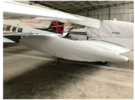
Beech Bonanza Wing Covers