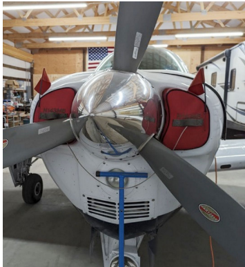
Beech Bonanza B33 Engine Inlet Plugs

Engine Inlet Plugs are custom fit for your Beech Bonanza/Debonair intakes, made with heavy-duty vinyl material, and stuffed with a single block of sculpted urethane foam. Each plug has a zipper that allows the foam to be removed and dried if necessary. Engine plugs have warning flags that are visible from the cockpit or 'remove before flight' streamers sewn onto the face of the plugs. Most plugs are imprinted with the aircraft registration number in black for an extra charge. Storage bag NOT included. Engine plugs may be inserted after flight when the engine is still warm. Engine Inlet Plugs are commonly referred to as Cowl Plugs, Intake Plugs, Cowl Blocks, Engine Blocks, and Engine Bungs. Designed to prevent damage to the aircraft extremities in crowded hangars, these products are made of bright red Naugahyde and thickly padded with a sandwich of closed cell foam. Nowadays they are also made using bright red Neoprene padded laminted (think: wetsuit material).