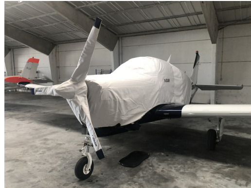
Beech Bonanza A-36 Extended Canopy/Engine Cover, 3-Blade Prop Cover