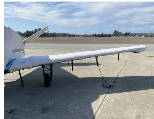
BEECH J35 WING COVERS