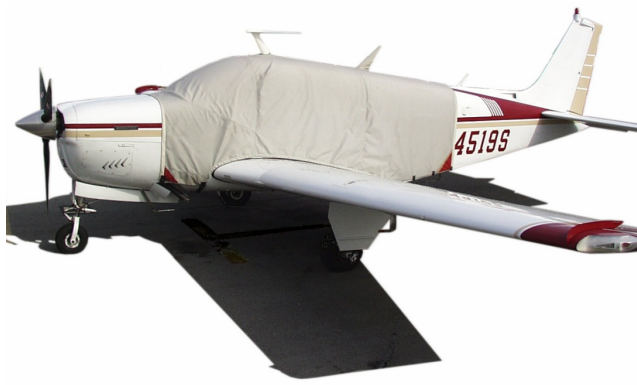
A36 Bonanza Extended Canopy Cover