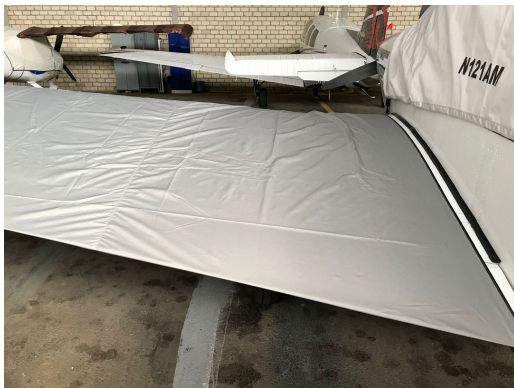
Beech Bonanza Wing Covers

WINTER USE MATERIAL - Made with Solution-Dyed Polyester fabric, this option is intended for seasonal use to aid in deicing, rain mitigation, or for occasional travel. The material is lighter and more compact, but more susceptible to UV damage and may have a shorter useful life if used continuously outside than the all-year use material.