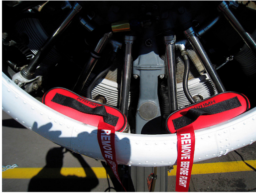
Beech 18 Carb Air Inlet Plugs

block of sculpted urethane foam. Each plug has a zipper that allows the foam to be removed and dried if necessary. Engine plugs have warning flags that are visible from the cockpit or 'remove before flight' streamers sewn onto the face of the plugs. Most plugs are imprinted with the aircraft registration number in black for an extra charge. Storage bag NOT included. Engine plugs may be inserted after flight when the engine is still warm. Engine Inlet Plugs are commonly referred to as Cowl Plugs, Intake Plugs, Cowl Blocks, Engine Blocks, and Engine Bungs.