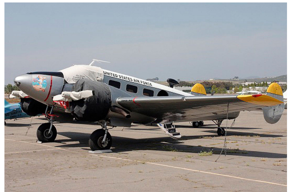
Twin Beech 18 Cockpit, Engine & Prop Covers