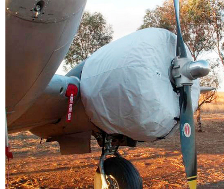
Beech D-18 Engine Covers, Center Section Oil Cooler Inlet Plugs, and Pitot Covers