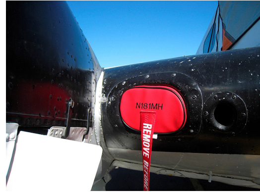
Beech 18 Oil Cooler Center Section Inlet Plugs