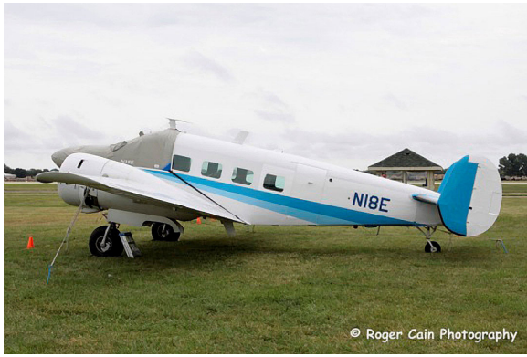
Twin Beech 18 Cockpit/Nose Cover