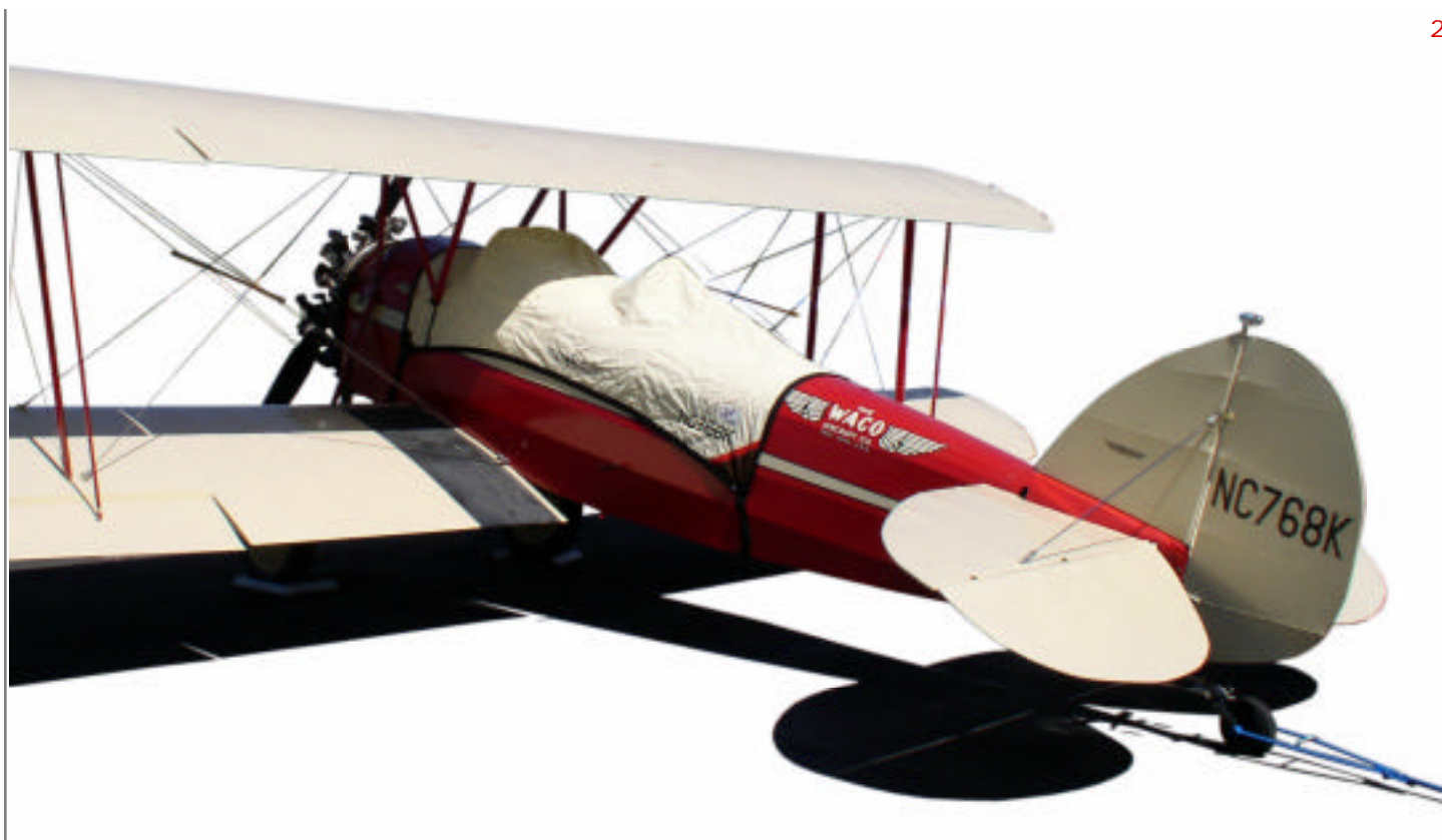
The Waco Canopy Cover (Shown on a Waco 10), aft view