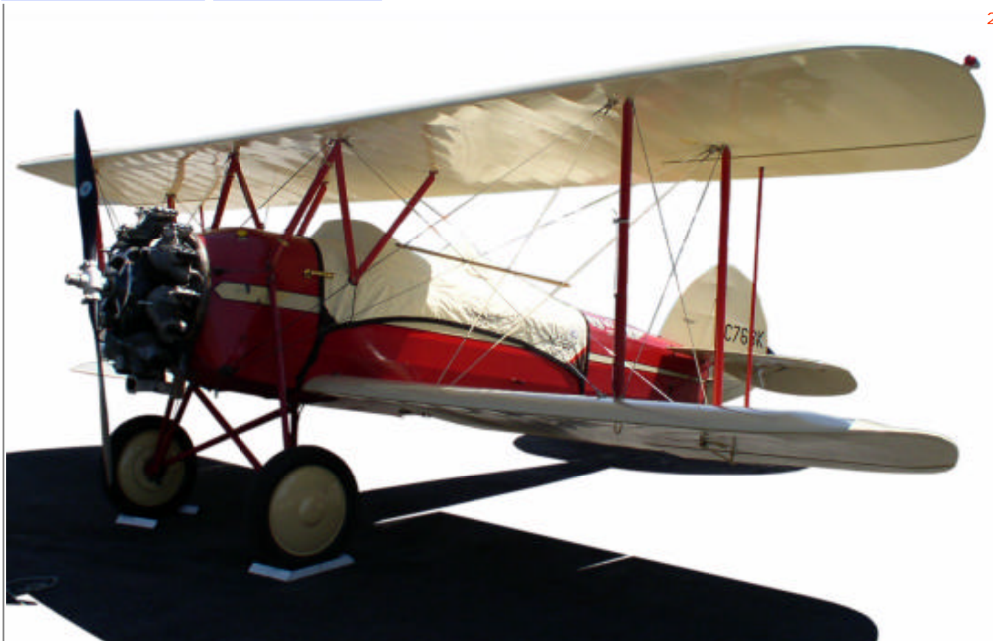
The Waco Canopy Cover (Shown on a Waco 10), front view

Canopy covers help reduce damage to your airplane's upholstery and avionics caused by excessive heat, and they can eliminate problems caused by leaky door and window seals. They keep the windshield and window surfaces clean and help prevent vandalism and theft.