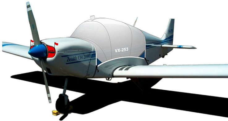
AMD Alarus CH2000 Std Canopy Cover & Engine Plugs (Illustration)

Engine Inlet Plugs are custom fit for your Aircraft Mfg. & Development Alarus CH2000 intakes, made with heavy-duty vinyl material, and stuffed with a single block of sculpted urethane foam. Each plug has a zipper that allows the foam to be removed and dried if necessary. Engine plugs have warning flags that are visible from the cockpit or 'remove before flight' streamers sewn onto the face of the plugs. Most plugs are imprinted with the aircraft registration number in black for an extra charge. Storage bag NOT included. Engine plugs may be inserted after flight when the engine is still warm. Engine Inlet Plugs are commonly referred to as Cowl Plugs, Intake Plugs, Cowl Blocks, Engine Blocks, and Engine Bungs.