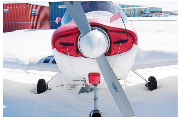
Alarus CH2000 Engine Plugs