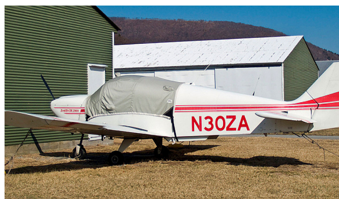
Alarus CH2000 Canopy Cover