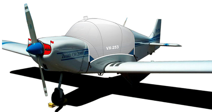
AMD Alarus CH2000 Std Canopy Cover & Engine Plugs (Illustration)

This cover type is made from Silver Acrylic Sunbrella canvas and is 100% lined with a soft and smooth microfiber. Bruce's Custom Covers developed this material combination especially for aircraft protection. The outer material is medium weight and treated for water resistance, UV resistance and anti-static buildup. The inner lining is a very soft and smooth microfiber to prevent scratching. The material is very reflective, and tests show that the cabin interior temperature can be reduced to near-ambient temperature on the hottest of days. It is water, ice and snow repellent, yet breathable to allow moisture to escape from between the cover and the aircraft surface.