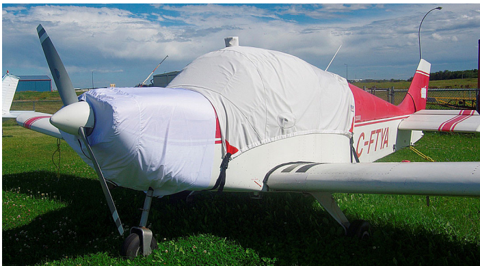
Alarus CH2000 Canopy Cover & Engine Cover (test fit)

This cover type is made from Silver Acrylic Sunbrella canvas and is 100% lined with a soft and smooth microfiber. Bruce's Custom Covers developed this material combination especially for aircraft protection. The outer material is medium weight and treated for water resistance, UV resistance and anti-static buildup. The inner lining is a very soft and smooth microfiber to prevent scratching. The material is very reflective, and tests show that the cabin interior temperature can be reduced to near-ambient temperature on the hottest of days. It is water, ice and snow repellent, yet breathable to allow moisture to escape from between the cover and the aircraft surface.