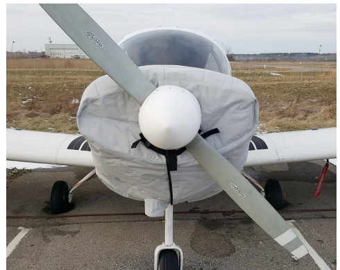
Alarus CH-2000 Insulated Engine Cover