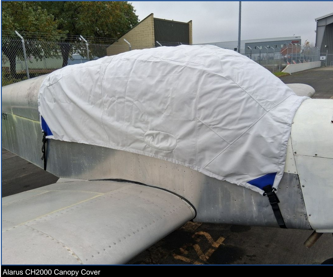
Alarus CH2000 Canopy Cover