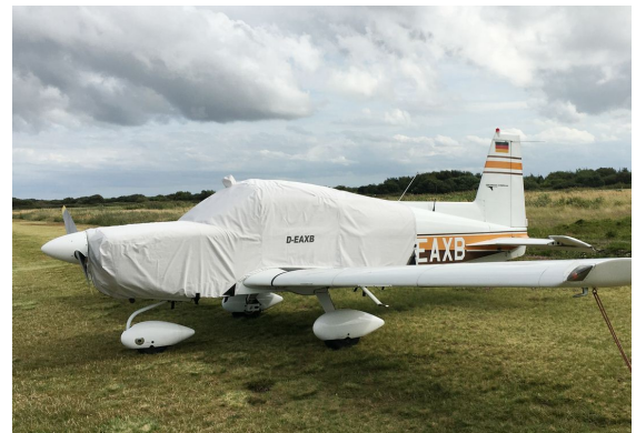
Grumman AA-5 Extended Canopy/Engine Cover