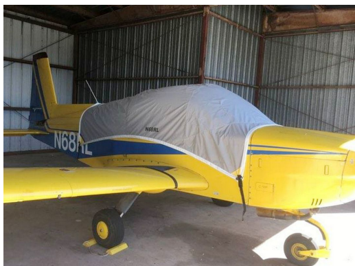
Grumman AA-5A Travel Canopy Cover

Travel Covers are made with Silver Solution-Dyed Polyester fabric and only lined over the windshield to save weight. The material is lightweight and more compact for easy stowage in the aircraft. The polyester material is water resistant, but only intended for occasional use outside. We also have an ultra lightweight material available for fitted hangar dust covers. For daily outdoor use, the non-travel Sunbrella Cover is the best choice.