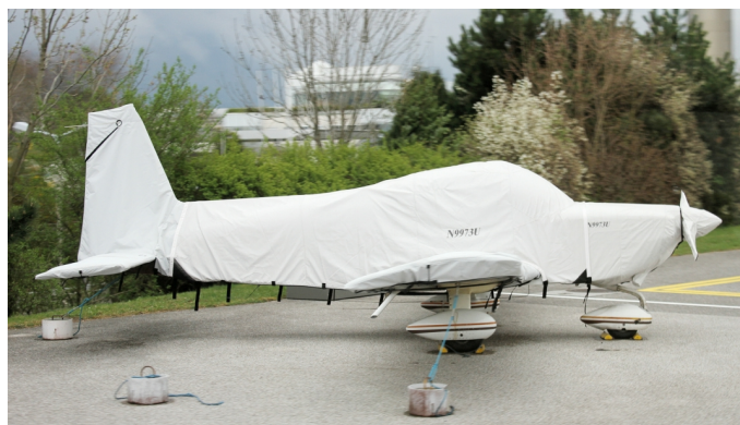
Grumman AA5: Full Cover Set