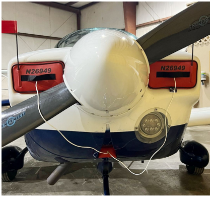
Grumman AA5 Cheetah Engine Inlet Plugs