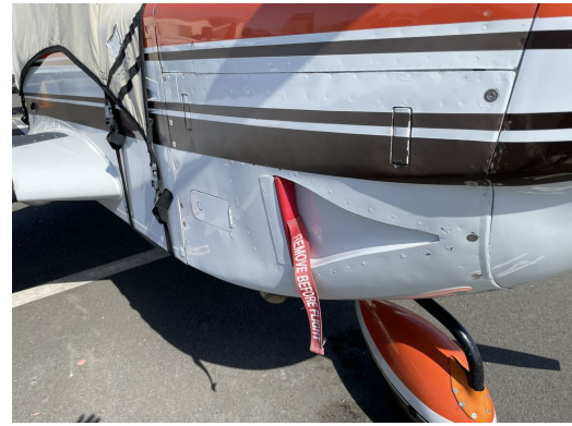
Grumman AA5 Side Cowling Inlet Plug