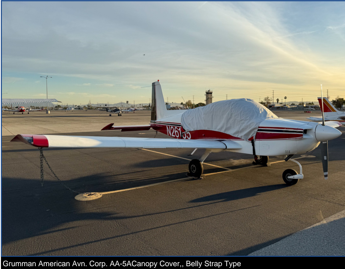
Grumman American Avn. Corp. AA-5A Canopy Cover,, Belly Strap Type