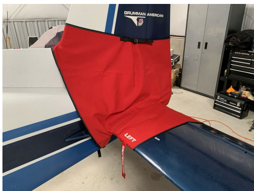
Grumman AA-5B Tailcone Cover

WINTER USE MATERIAL - Made with Solution-Dyed Polyester fabric, this option is intended for seasonal use to aid in deicing, rain mitigation, or for occasional travel. The material is lighter and more compact, but more susceptible to UV damage and may have a shorter useful life if used continuously outside than the all-year use material.