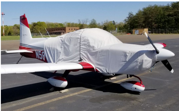
Grumman AA-5 Extended Canopy/Engine Cover

This cover type is made from Silver Acrylic Sunbrella canvas and is 100% lined with a soft and smooth microfiber. Bruce's Custom Covers developed this material combination especially for aircraft protection. The outer material is medium weight and treated for water resistance, UV resistance and anti-static buildup. The inner lining is a very soft and smooth microfiber to prevent scratching. The material is very reflective, and tests show that the cabin interior temperature can be reduced to near-ambient temperature on the hottest of days. It is water, ice and snow repellent, yet breathable to allow moisture to escape from between the cover and the aircraft surface.