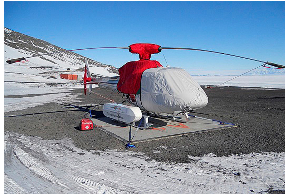
AS350 Bubble Cover w/ Cargo Mirror, Blade Tie-downs, Insulated Engine, Insulated Main Rotor Hub & Insulated Tail Rotor Covers