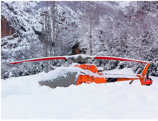
AS350 Bubble Cover, Insulated Main & Tail Rotor Covers, Blade Covers with tie-down detail