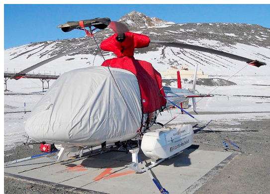
AS350 Bubble Cover w/ Cargo Mirror, Blade Tie-downs, Insulated Engine, Insulated Main Rotor Hub and Insulated Tail Rotor Covers