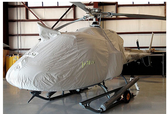
AS350 B3 Main Body Cover (Covers Bubble/Cabin, Engine Area and Exhaust)