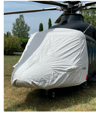
Agusta AW139 Cockpit/Nose Cover