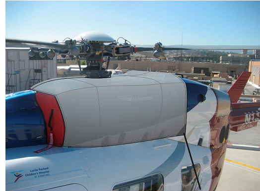
Bubble Cover w/ nose mounted radome, Upper Deck Plugs/Cover Upper Deck Plugs/Cover, extended to cover aft intake vents