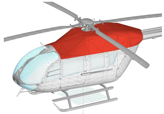
Intake/Exhaust Engine Area Cover, 3D Rendering