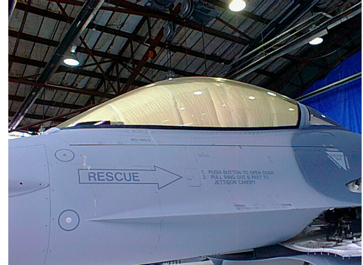
General Dynamics F-16 Cockpit HeatShields