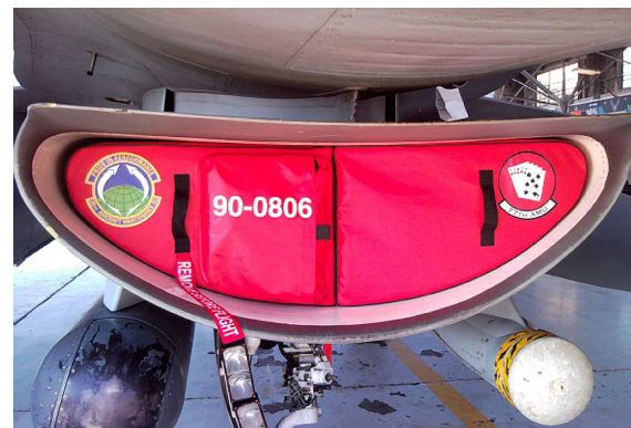
F-16 Folding Intake Plug with Forms Pouch and Custom Artwork