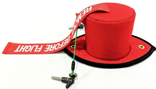
General Dynamics F-16 AOA Probe Cover

The Engine Inlet Plugs are custom fit for your General Dynamics F-16 Fighting Falcon intakes, made with heavy-duty vinyl material, and stuffed with a single block of sculpted urethane foam. Each plug has a zipper that allows the foam to be removed and dried if necessary. Engine plugs have 'remove before flight' streamers sewn onto the face of the plugs. Most plugs are imprinted with the aircraft registration number in black for an extra charge. Storage bag NOT included. Engine plugs may be inserted after flight when the engine is still warm. Engine Inlet Plugs are commonly referred to as Cowl Plugs, Intake Plugs, Cowl Blocks, Engine Blocks, and Engine Bungs.