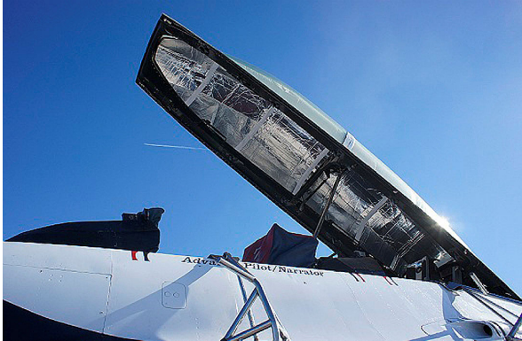
F-16 Cockpit HeatShields

Cockpit Heatshields are interior sunshades for the aircraft's cockpit. The product is a unique composite of closed-cell foam with a silver mylar finish. The semi-rigid design is stiff enough to stand inside the window framing. The set folds up flat and is easily stored in the included storage sleeve. Some designs may require velcro and suction cups. Our Heatshields for jets are offered white side out because some aircraft manufacturers have issued advisories against reflective window inserts due to potential heat damage. A Heatshield is an excellent short-term remedy for cockpit overheating, but an external fabric cover is more effective for long-term protection.