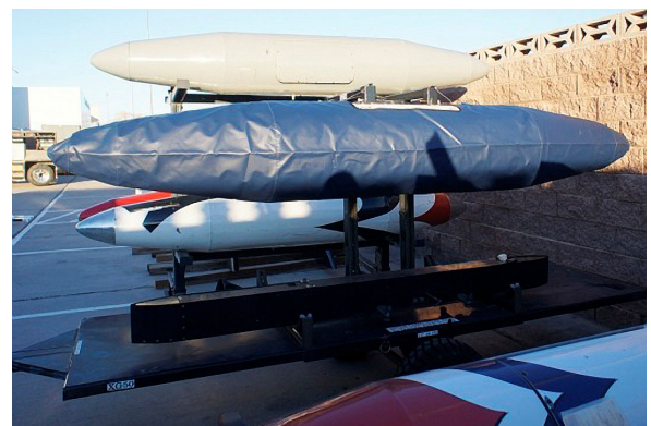
F-16 Cargo Pod Cover, similar to the Centerline Fuel Tank Cover