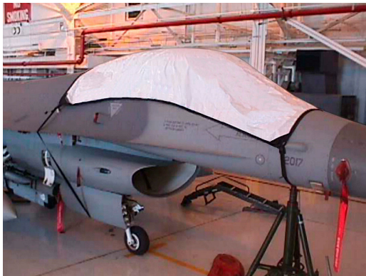
F-16 "Blackout" type Canopy Cover

This cover type is made from Silver Acrylic Sunbrella canvas and is 100% lined with a soft and smooth microfiber. Bruce's Custom Covers developed this material combination especially for aircraft protection. The outer material is medium weight and treated for water resistance, UV resistance and anti-static buildup. The inner lining is a very soft and smooth microfiber to prevent scratching. The material is very reflective, and tests show that the cabin interior temperature can be reduced to near-ambient temperature on the hottest of days. It is water, ice and snow repellent, yet breathable to allow moisture to escape from between the cover and the aircraft surface.