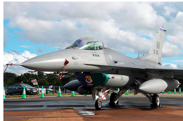
Intake, Maintenance Seat & HUD display covers (Aviano AFB) Intake, Maintenance Seat & HUD display covers (Aviano AFB, Italy)