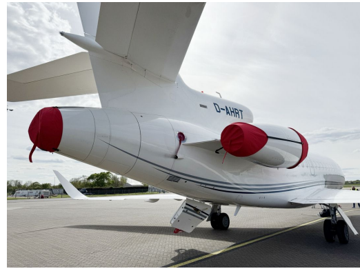
Falcon 900LX Engine Covers