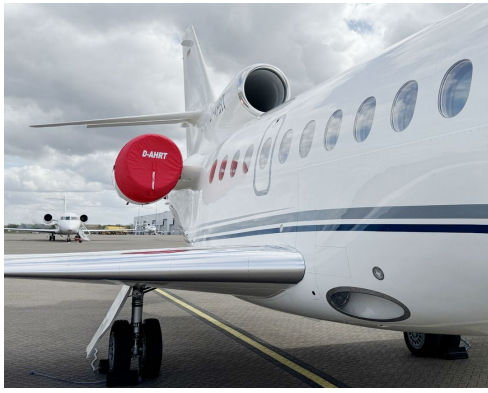
Falcon 900LX Engine Covers