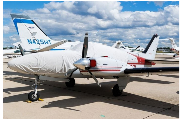
Beech Baron D55 Canopy/Nose Cover