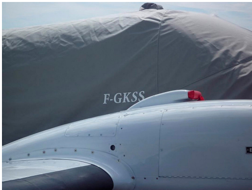
Baron Cowl Top Scoop Plugs

Engine Inlet Plugs are custom fit for your Beech Baron 58TC intakes, made with heavy-duty vinyl material, and stuffed with a single block of sculpted urethane foam. Each plug has a zipper that allows the foam to be removed and dried if necessary. Engine plugs have warning flags that are visible from the cockpit or 'remove before flight' streamers sewn onto the face of the plugs. Most plugs are imprinted with the aircraft registration number in black for an extra charge. Storage bag NOT included. Engine plugs may be inserted after flight when the engine is still warm. Engine Inlet Plugs are commonly referred to as Cowl Plugs, Intake Plugs, Cowl Blocks, Engine Blocks, and Engine Bungs.