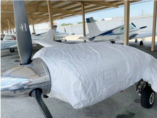
Beech Baron 58P Wing/Engine Covers (test fit)

WINTER USE MATERIAL - Made with Solution-Dyed Polyester fabric, this option is intended for seasonal use to aid in deicing, rain mitigation, or for occasional travel. The material is lighter and more compact, but more susceptible to UV damage and may have a shorter useful life if used continuously outside than the all-year use material.