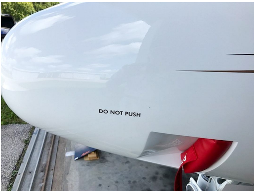
Beech Baron Nose Air Inlet Plugs, set of 2