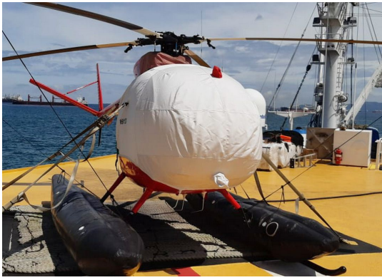
Hughes 500C (369HS) Bubble Cover