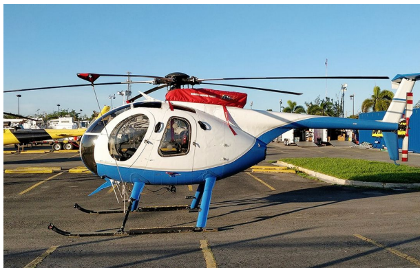
Hughes 500D Blade Tie-Downs, Doghouse Cover

WINTER USE MATERIAL - Made with Solution-Dyed Polyester fabric, this option is intended for seasonal use to aid in deicing, rain mitigation, or for occasional travel. The material is lighter and more compact, but more susceptible to UV damage and may have a shorter useful life if used continuously outside than the all-year use material.