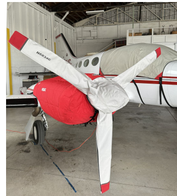
Cessna 421 Propellor/Spinner Covers, 3 Blade