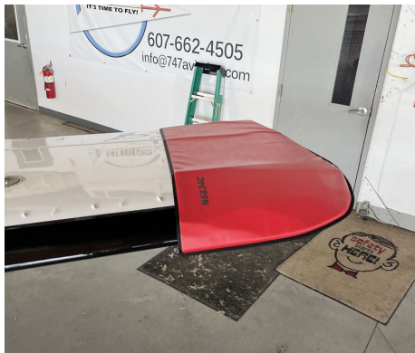
Cessna 421C Wingtip Pads

Designed to prevent damage to the aircraft extremities in crowded hangars, these products are made of bright red Naugahyde and thickly padded with a sandwich of closed cell foam. Nowadays they are also made using bright red Neoprene padded laminated (think: wetsuit material).