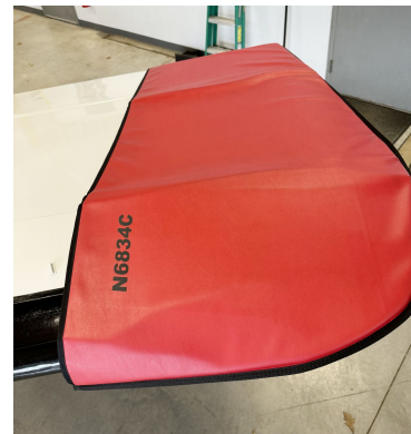
Cessna 421C Wingtip Pads