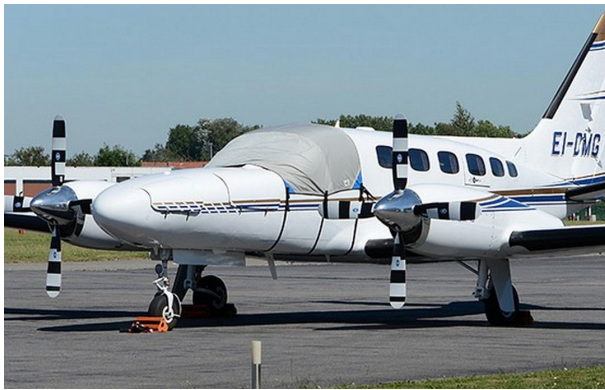
Cessna 441 Cockpit Cover

This cover type is made from Silver Acrylic Sunbrella canvas and is 100% lined with a soft and smooth microfiber. Bruce's Custom Covers developed this material combination especially for aircraft protection. The outer material is medium weight and treated for water resistance, UV resistance and anti-static buildup. The inner lining is a very soft and smooth microfiber to prevent scratching. The material is very reflective, and tests show that the cabin interior temperature can be reduced to near-ambient temperature on the hottest of days. It is water, ice and snow repellent, yet breathable to allow moisture to escape from between the cover and the aircraft surface.